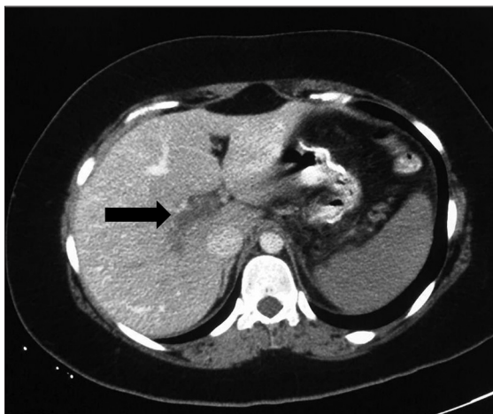
Figure 1. CT scan of abdomen of a 23-year old female showing evidence of portal vein thrombosis (arrow).

Confirmation of the identity of this infrequent organism was completed by the analysis of regions from a large subunit of ribosomal RNA, amplified using primer: 5.8SR (5'-TCGATGAAGAACGCAGCG) and LR7 (5'- TACTACCACCAAGATCT). A neighbor-joining phylogenetic tree was constructed based on sequences from 26S rRNA gene sequence-based analysis. The evolutionary analyses were conducted with MEGA v6 software. 7 The analysis showed that the isolate V49-4 (GenBank accession number MG583716; https://www.ncbi.nlm.nih.gov/nucleotide/MG583716 ) is a member of the genus Pichia . The strain V49-9 falls in the branch of