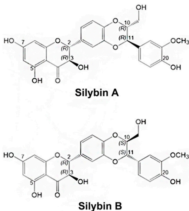
Figure 1. Chemical structures of silybin diastereomers.

The goal of the present paper is to summarize and highlight the current knowledge of the metabolism and transport of silymarin/silybin and drug–drug interactions mediated by metabolizing enzymes and transporters.