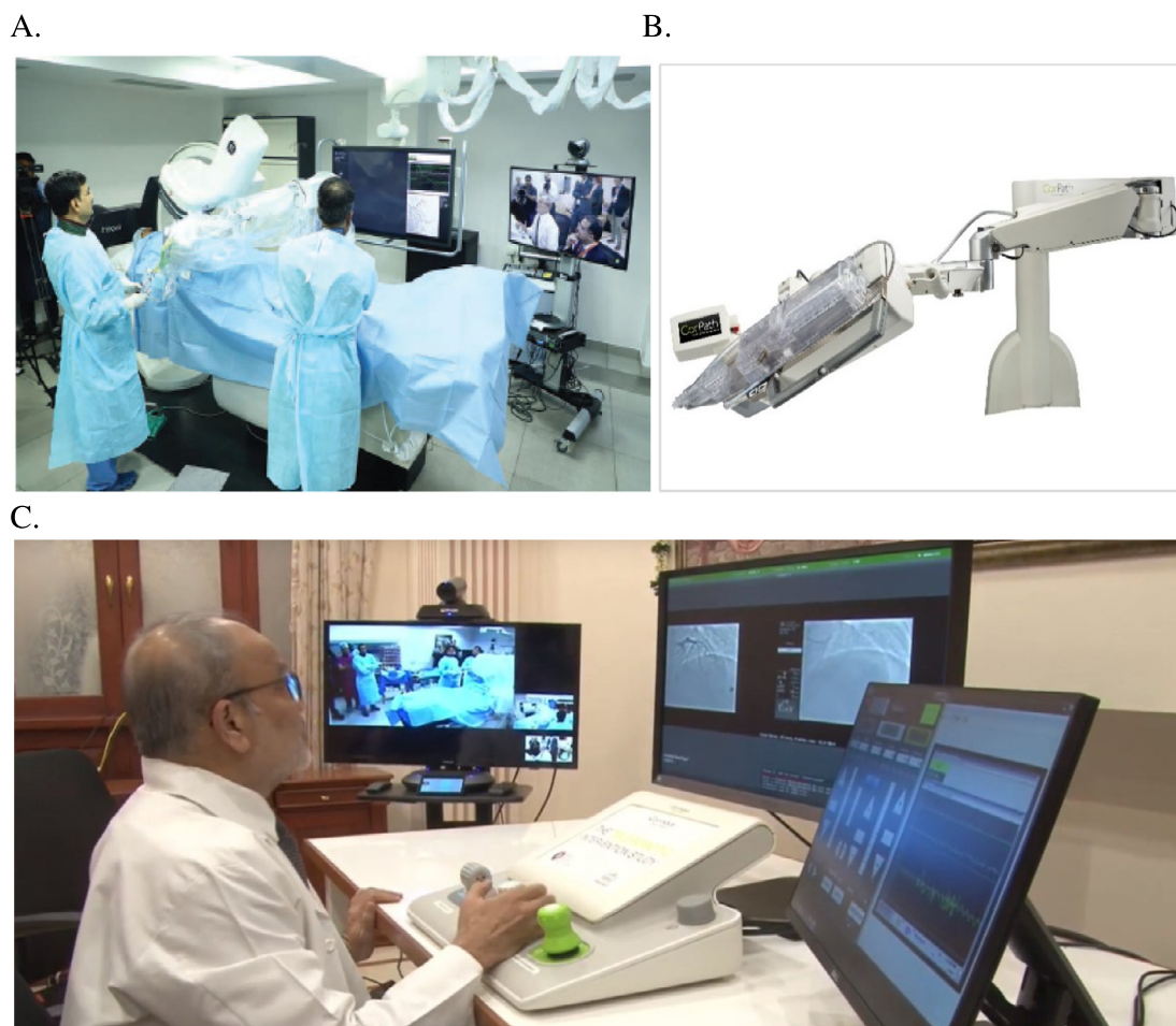
Fig. 1. Photographs of the catheterization laboratory (A), CorPath GRX bedside Robotic Arm (B), Cassette and Remote Robotic Control Work Station (C).

imaging unit, performed contrast injections, and inflated/deflated the angioplasty balloon upon direction of the remote operator. These functions could also be performed by the remote operator. The guide catheter was advanced through the introducer sheath into the coronary ostium by the in-lab cardiologist. At this point, the remote operator, working from the Remote Robotic Workstation advanced the guidewire, advanced the balloon catheter over the guidewire, and after successful pre-dilation of the stenosis, deployed a stent. The guide wire was then withdrawn, final angiograms were recorded, and the guide catheter was withdrawn by the in-lab cardiologist. In view of the unprecedented nature of this procedure, the in-lab interventional cardiologist and a cardio-thoracic surgical team were available throughout the procedure on-standby to provide emergency support if needed. Following completion of the procedure, a 5-item questionnaire was answered by the primary operator (Appendix 1). The procedures were performed on December 1 and 2, 2018.