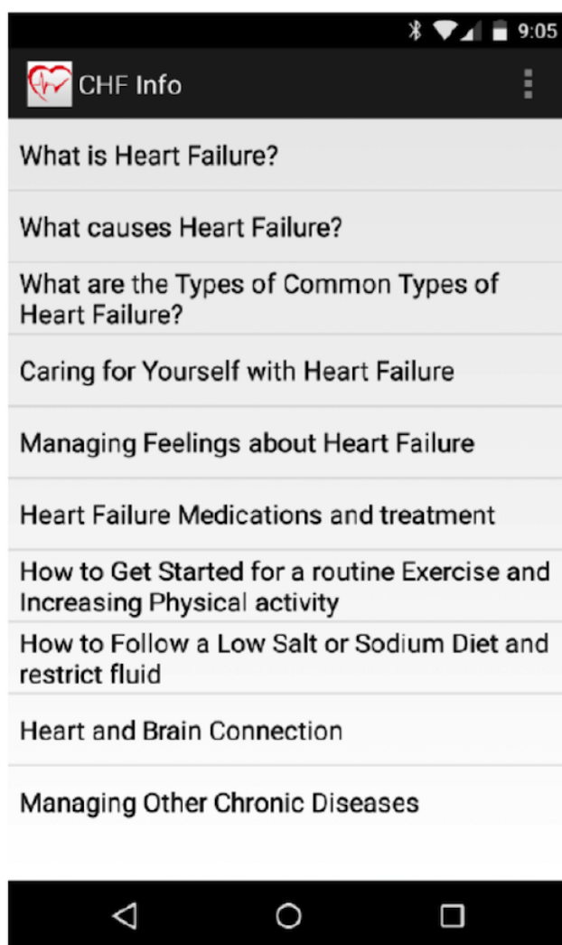
Figure 3. Congestive heart failure (CHF) info app.

The usability of HeartMapp questionnaire validated in a prior study ( r=.468-.635 ) [18] has a total of 25 questions in a 5-point Likert scale [16]. This questionnaire assessed the ease of use, problem-solving capabilities, accuracy and clarity of presentation, and satisfaction with the use and design of HeartMapp. Open-ended questions were included at the end for comments on specific task needs.