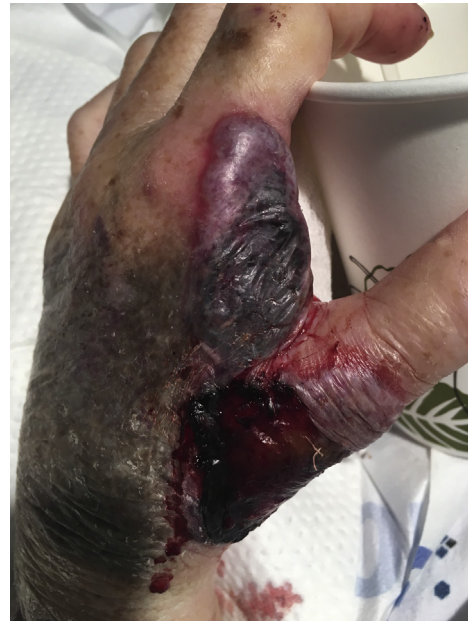
Fig 2. Hemorrhagic bulla of the left thumb.

after ureteral stent replacement, with creatinine down-trending to 1.24 mg/dL. Serum bacterial, mycobacterial, and fungal culture results were negative, as were results from specific tests for mycoplasma, herpes simplex, varicella zoster, Aspergillus , Cryptococcus , and histoplasma.