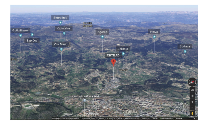
Figure 2 Satellite 3D image of the 9 different sampling locations in relation to the CHTMAD hospital centre in Vila Real, Portugal.

collected from different points of each corresponding drinking trough and cowshed, respectively. Swabs were collected into Stuart transport media; water was recovered into 500 mL PET flasks with 60 mg/L sodium thiosulphate and soil was gathered into appropriate zipper seal sample bags. Samples were processed in the same day or stored at 4°C for a maximum of 24 h. Swabs and soil samples were incubated into Brain Heart Infusion broth with 6.5% (w/v) NaCl for 48 h at 37°C and after seeded on Oxacillin Resistance Screening Agar Base (ORSAB) supplemented with 2 mg/L oxacillin. Water samples were filtered through 47 mm 0.2 µm filters that were further placed on ORSAB plates with 2 mg/L oxacillin. All plates were incubated for 24 to 48 h at 37°C and after screened for presumptive