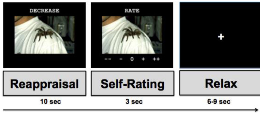
Figure 1. Example trial of the fMRI emotion regulation reappraisal task