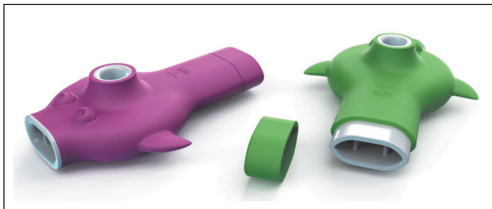
Fig. 1. The device is a plastic vortex whistle consisting of an inlet, a circular main chamber, and a vertical outlet.

The children and their parents answered the Pediatric Asthma Quality of Life Questionnaire (PAQLQ) at study start. 9 In addition, the parents and children were asked to fill in the Childhood Asthma Control Test (C-ACT). 10 The C-ACT contains seven selected items; three items were answered by the children and four by the parents. The children completed the questionnaire at the end of each week a total of four times (C-ACT 1–4), while the parental questionnaire collects symptoms during the last 4 weeks and was therefore only answered at the end of the 4-week study period. All the questionnaires were paper based and collected at the end of the study period. The potential range in score was 0–12 and 0–15 for the children and parental questionnaire, respectively. At the end of the study period, the children questionnaire from week 4 (C-ACT 4) and the parental questionnaire were summarized to obtain a total score for the C-ACT, with a potential range in score from 0 to 27. A total C-ACT score