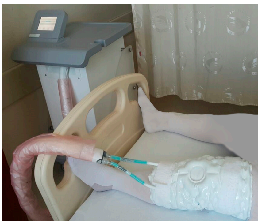
Figure 1. Application of cryotherapy pad on a patient.

TKA is a major orthopedic surgery that causes tissue damage and inflammation [4,5]. Cold treatment mainly works by increasing the pain threshold and endorphin release. In addition, it reduces edema, inflammation, and muscle spasm due to vasoconstriction, which indirectly reduces pain [6]. On the contrary, cryotherapy pad wrapped completely around the knee allows the treatment effect to cover a larger area than that with a traditional cold pouch. In addition, cryotherapy provides a more efficient cooling effect and maintains the temperature at levels that reduce the formation of edema (Figure 1). Therefore the quality of life of the patient is increasing due to faster mobilization, reduced need for pain killers and reduced length of stay in the hospital. Thus, with the aforementioned varying levels of efficacy, this study aimed to evaluate the effect of cryotherapy on clinical and functional outcomes in patients undergoing TKA and compare cryotherapy to the conventional method of cold ice pack compressions.