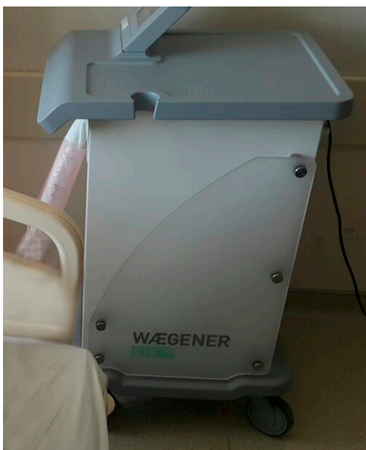
Figure 2. Adjustable cryotherapy device.

The patients were divided into three main groups. In Group 1, the patients were administered cryotherapy (8–12 °C) around the knee for 4 h before the operation. After the operation, cryotherapy was applied for the first 6 h; on the first postoperative day, it was applied at 2 h intervals. On the second and third postoperative days, it was applied every 6 h for 2 h. In Group 2, preoperative application of cryotherapy was not performed; the postoperative application was the same as that in Group 1. In Group 3 (control group), a cold pack (gel ice) was applied as standard treatment for 20 min every 2 h for 3 days postoperatively. All patients underwent only unilateral primary TKA. Cryotherapy and gel ice application were performed on the skin via anti-embolic socks or bandages. The cryotherapy device (Waegener®, Beerse, Belgium) is composed of a server and c-pad. The c-server drives the c-pad by use of the selected c-protocol. The device enables controlled-temperature modulation with cooling at a specific temperature (11 °C) for a prolonged time (Figure 2). Care was taken to avoid contact with the skin.