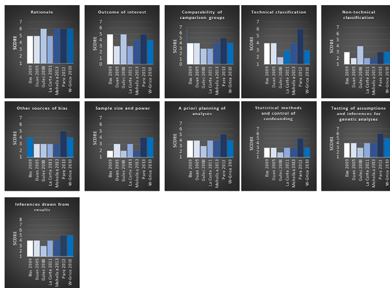
Fig 2. Scores for each study and the distribution of the 11 methodological aspects.

https://doi.org/10.1371/journal.pone.0224858.g002