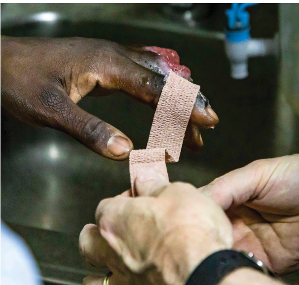
Fig. 10. He then applied Vaseline coated Coban tape directly to the wounds to keep the wounds greasy.