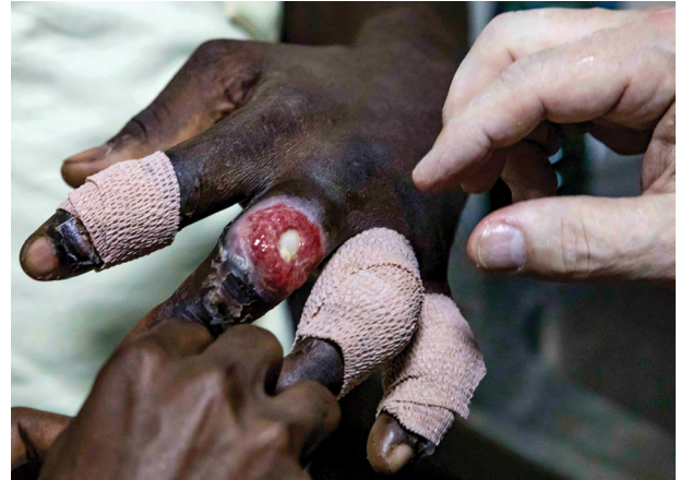
Fig. 11. The same treatment was applied to all 4 fingers daily after the shower and bottled water rinse.