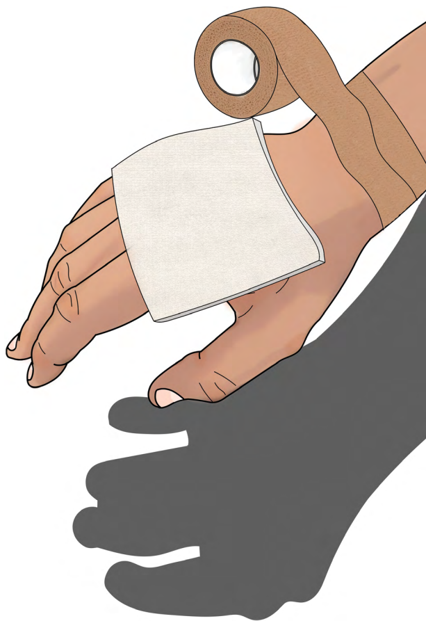
Fig. 5. Cover wound with clean greased bandage so the wound does not dry and die.

barriers work just as well in most cases. After washing our hands (gloves are not necessary), and after the wound has been rinsed with clean shower or bottled water, we apply a clean bandage onto which we smear a thick layer of clean Vaseline (see Video 2 [online]). The grease provides a barrier to keep the water in the raw wound, so it does not dry and die. The Vaseline does not need to be sterile, but it should be clean. It can be spread onto the bandage thickly with a clean butter knife before covering the wound with the clean bandage. The bandage does not need to be sterile.