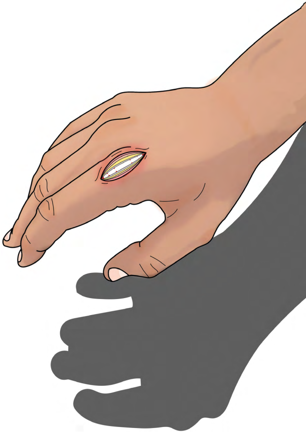
Fig. 1. Raw wound with exposed bone, joint, and tendon.