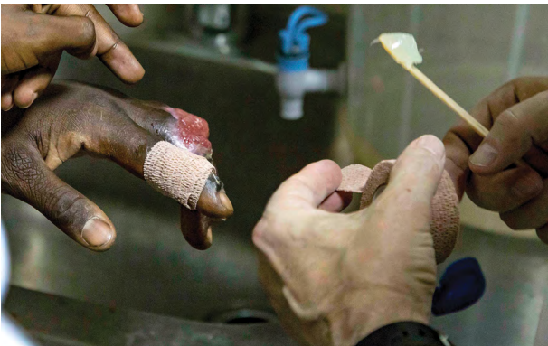
Fig. 9. He applied Vaseline directly to Coban tape after cleaning the wound daily.