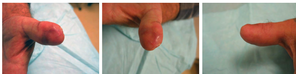
Fig. 14. Six weeks later, the wound was healed. Moberg flap is not required in many cases.