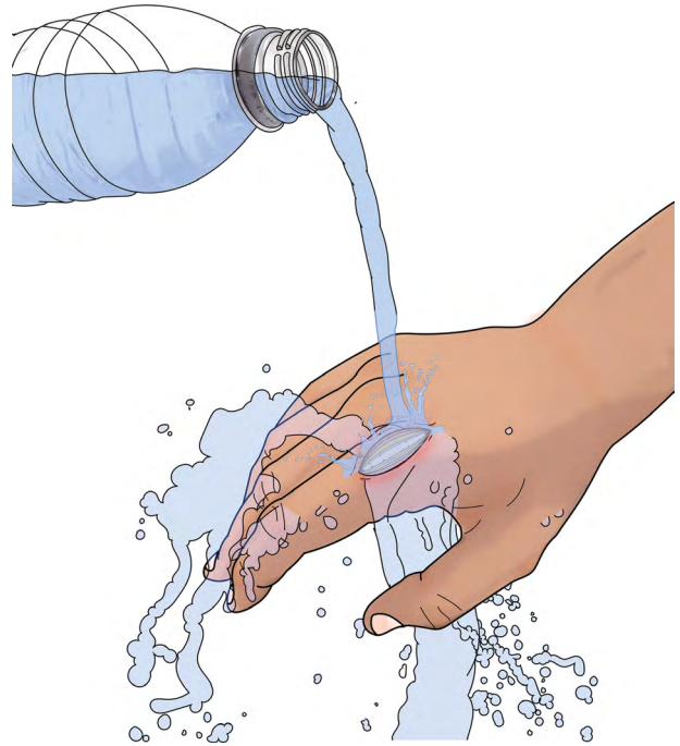
Fig. 3. Rinse the wound with bottled water if the shower water is not clean water.

The main rule for raw wounds is that we cannot let the tissues dry and die. Once we lose the waterproof barrier of the skin, the underlying tissues will die if