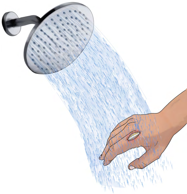
Fig. 2. Daily shower water to rinse the wound.