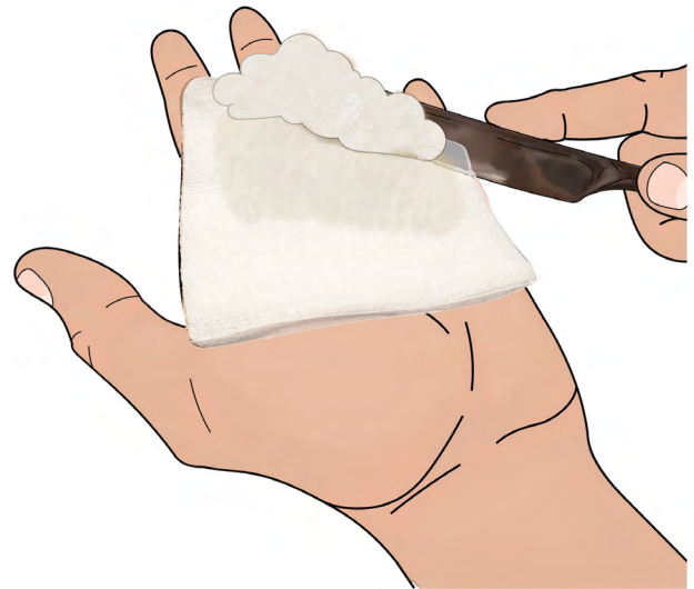
Fig. 4. Apply Vaseline thickly to clean bandage with a clean butter knife (everything does not need to be sterile, just clean).

they are allowed to dry. Tissues are drying, tissues are crying (they hurt, and the patient feels pain), tissues are dying.