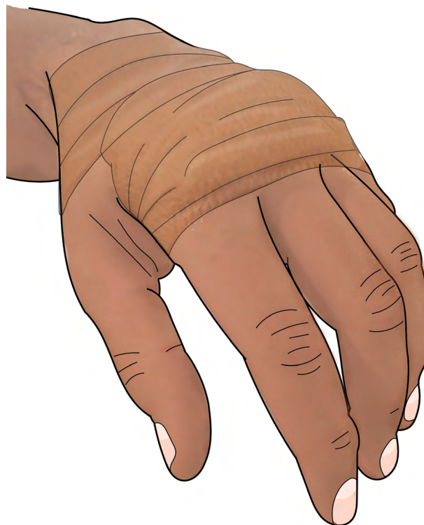
Fig. 6. Keep the bandage secure with tape, such as Coban, so the wound stays covered with grease.

Dressings do not need to be sterile, just clean. 6 Sterile dressings are expensive and unnecessary. Coban tape off the roll is a good clean dressing that can be directly applied over grease on fingers and leg wounds. 2 Panty liners, sanitary napkins, and diapers out of the package are another good source of clean inexpensive dressings. 7 Every day, the old dressing is removed and the patient gets in the shower to let clean water run over the wound. After the shower, grease is applied thickly to a clean bandage.