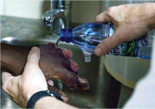
Fig. 8. He rinsed the wound daily in the shower followed by bottled drinking water rinse.