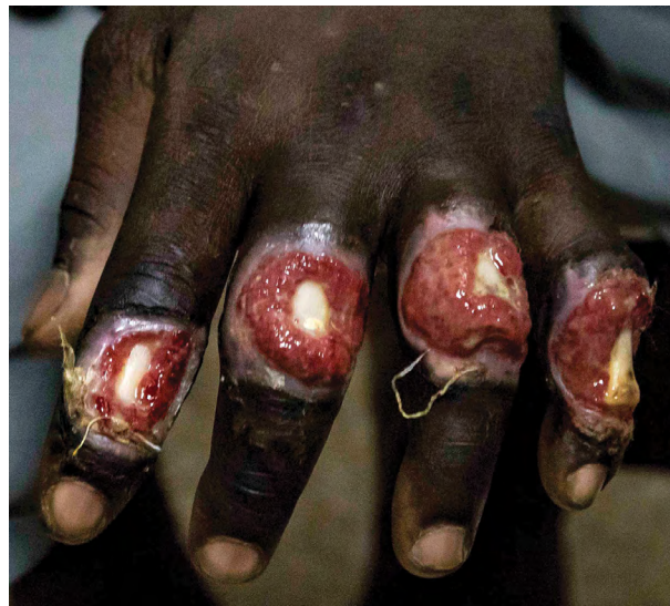
Fig. 7. Exposed bone in 4 fingers in a patient in Ghana in 2017.

That is placed on the wound to pad it, protect it, and keep it moist until tomorrow (Figs 13 and 14).