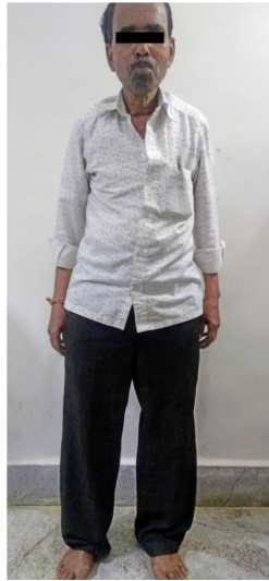
Figure 2 Patient walking unsupported at three months after the surgery.

injury. The surgical management of these fractures represents only a part of the complete treatment protocol. The main goal of medical management should include correction of the drug-induced osteoporosis. Bisphosphonates and vitamin D supplementation should be used in the post-operative period for this purpose. Replacement surgery is a good treatment modality for displaced neck fractures with delayed presentation.