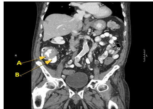
Figure 2. Coronal view, CT scan abdomen with contrast: Arrow 'A' pointing at malignant mass, which appears to encircle colonic wall to give an apple-core like lesion picture. Arrow 'B' is pointing at cecum.