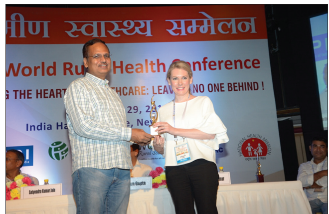
Figure 13: FISFA – Short Film Festival Award

conference. Members of Rural Seeds organized a popular “rural café” during WRHC 2018 which was streamed live. The cultural events of WRHC 2018 truly captured the essence of India and helped delegates relax and enjoy Indian culture and cuisine. Students and artists from University of Delhi contributed to the cultural evening [Figure 14].