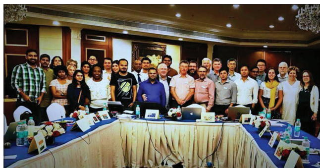
Figure 5: WONCA Rural Council Meeting

The Health Minister of the Government of National Capital Territory (GNCT) of Delhi, Mr Satendra Jain, graced the healthcare leadership award ceremony on 27 th April 2018. Awards were presented to distinguished health care leaders for their exemplary service in rural areas. The honorable minister was pleasantly surprised to attend the health conference which was hosted in such a big way without the assistance of any pharma sponsor. He also appreciated the role of family doctors in the society [Figure 14].