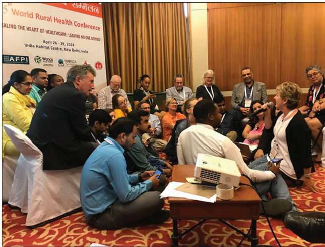
Figure 8: Rural Café for students and young doctors