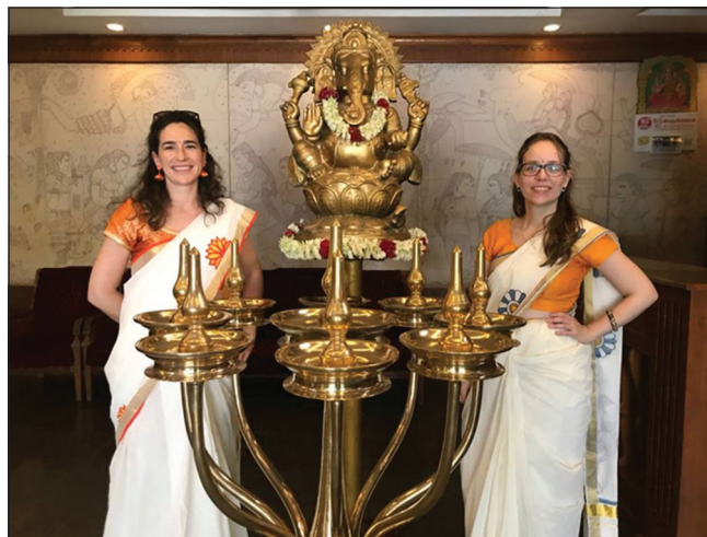
Figure 6: Sojourn – Rural Health Visits Kerala India (Delegates from Spain and Brazil)