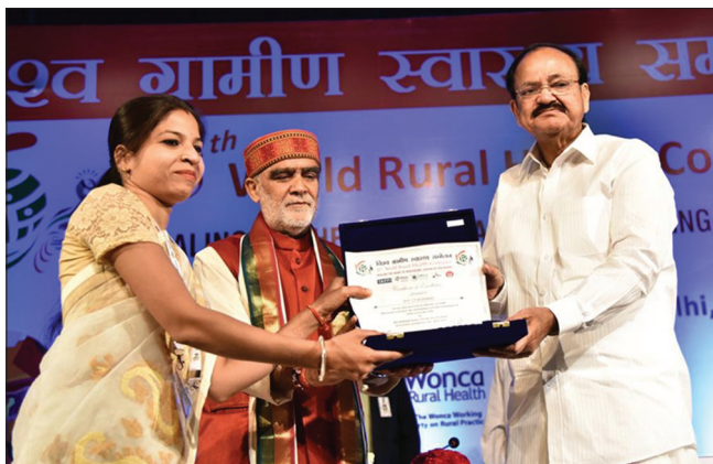
Figure 3: Award to ASHA and Nurses – Community Health Workers