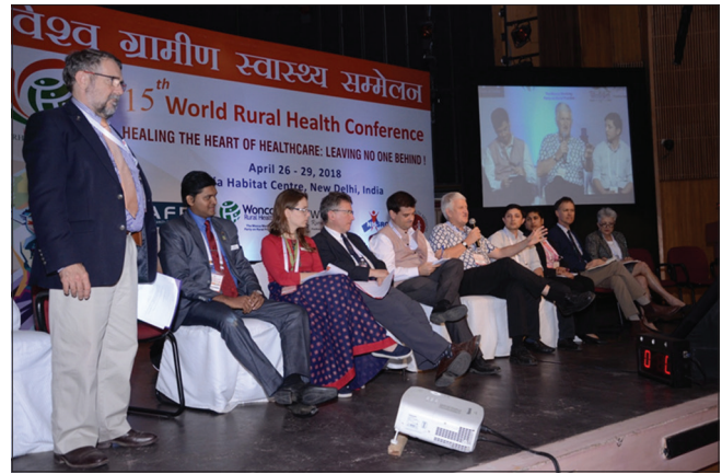
Figure 9: Rural Health Assembly