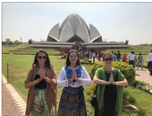
Figure 7: Local sight Seeing Delhi (Brazilian delegates)