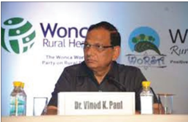
Figure 16: Dr Vinod K Paul: Member Niti Ayog speaking at the national consultation on rural health

of the Parliament of India. ( https://www.youtube.com/watch?v=0uUQS2Ye1hk )