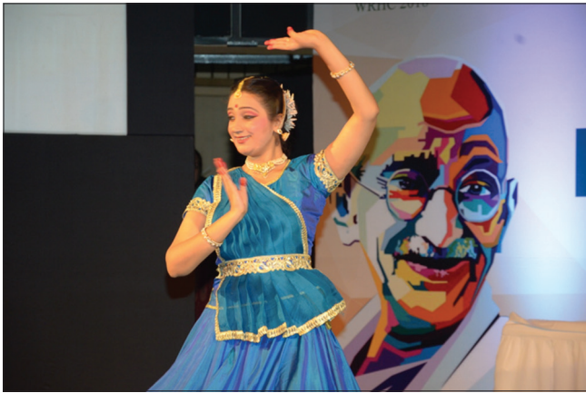
Figure 14: WRHC 2018 Cultural Evening