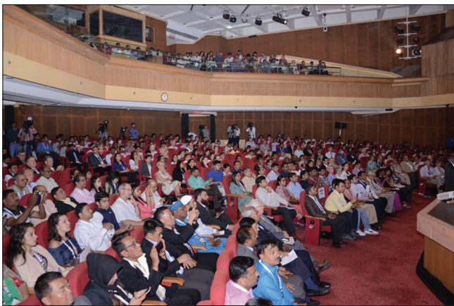
Figure 10: Full house – delegates from forty countries