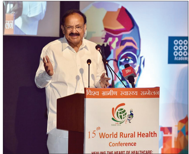
Figure 2: Inaugural Speech by Mr M Venkaiah Naidu Honorable Vice President of India and Chairman of ‘Rajyasabha’ the upper house of the Indian Parliament