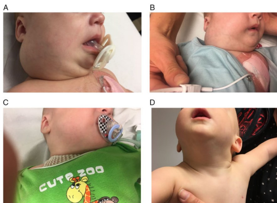
Figure 1. Clinical impression of the right-sided cervical mass (A) before initiation of larotrectinib, (B) at week 3 of treatment, (C) at week 9 of treatment and (D) at week 25 of treatment.

The parents noticed a change in tumour consistency within 4 days, which was confirmed during the next clinic visit at C1D8 when the index lesion appeared softer, more mobile upon palpation and reduced in size. The rapid tumour regression continued over the following days and weeks (Figure 1B–D). At the first scheduled control MRI carried out on day 56 of larotrectinib treatment (C3D1), the only abnormality remaining was a solitary, slightly enlarged right cervical lymph node which measured 1.2 \times 1.2 \times 0.8 cm (ca. 0.6 \text{ cm}^3 ; Figure 2B). According to the