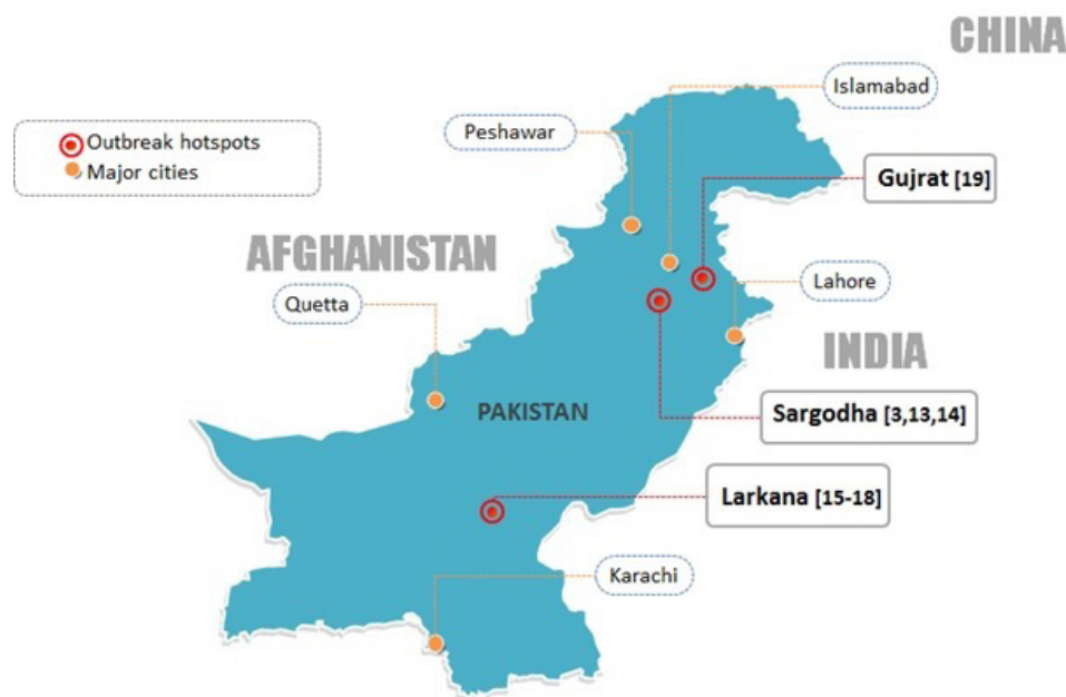
Figure 1 Map of Pakistan showing hot spots of reported HIV outbreaks.

continue to be a major hurdle in any future efforts for harm reduction. According to a United Nations Programme on HIV/AIDS 2017 survey, condom usage was low among major high-risk groups, such as trans-genders (24%), injection drug users (15%) and men who have sex with men (22%). Knowledge about HIV prevention among young men and women (aged 15–24) was, respectively, 5.2% and 4.2%. 10 The rate at which the epidemic is currently growing in the rural areas alludes to serious gaps in the harm reduction efforts. It is imperative to educate vulnerable masses in the rural areas about treatment and further prevention of transmission. Considering that a major part of the infected population is younger individuals, it is important to target harm reduction efforts to that particular group. In the face of prevailing unawareness, not only the epidemic will continue to spread but will likely give rise to HIV variants that may be hard to treat.