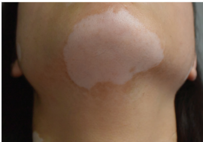
Figure 2. Large white spot with a clear border observed in a patient prior to treatment.