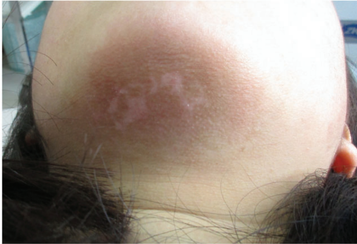
Figure 3. Change in coloration following treatment.