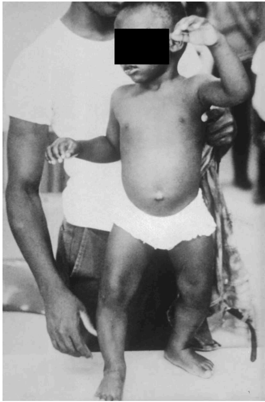
FIGURE 2 | Child suffering from vitamin D deficiency rickets in 1970—image obtained from the Center for Disease Control via the Public Health Image Library (PHIL) at https://phil.cdc.gov/phil/details.asp (open access).

A true modern understanding of the pathophysiological basis of rickets did not begin until the early twentieth century. In 1919, Mellanby discovered and published on the “4th vitamin,” stating “Rickets is a deficiency disease which develops in consequence of the absence of some accessory food factor or factors. It therefore seems probable that the cause of rickets is a diminished intake of an anti-rachitic factor, which is either fat-soluble factor A, or has a similar distribution to it” (22). McCollum, who had previously raised the possibility of the existence of “fat-soluble A,” subsequently named this factor “vitamin D” (as vitamins A, B, and C were already named) (23). Following these discoveries, Alfred Hess (and others), a pediatrician and nutrition researcher, pioneered cod liver oil supplementation (now known to be a rich source of vitamin D), in an African American community in 1917 (24). Hess also documented an increased risk of rickets with unsupplemented breastfeeding and changes in season (24–26), risk factors that have now been confirmed in multiple recent studies and included in recent global consensus guidelines (2, 4, 27). Also at this time, animal experiments by Shipley and Park (28) highlighted the healing of rickets with cod liver oil and UVB light exposure.