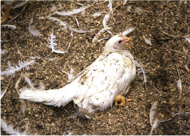
FIGURE 2 Early access to litter can reduce feather pecking in comparison to housing on wire floors (Johnsen et al., 1998)

the authors concluded that a suitable feed substrate promotes foraging behaviour and SFP reduction or even delay. Similar results were obtained by Dixon & Duncan, 2010, who also observed that sandbath substrates, when provided as the only manipulable material in the husbandry environment, are not able to reduce SFP. In this comparison, chicks were kept on wired floors or on solid floors covered with peat moss. Gilani et al. (2013) identified a higher risk for SFP in the laying period when SFP already occurred during rearing due to insufficient access to manipulable material. In a study by Green, Lewis, Kimpton, and Nicol (2000), the absence of fluffy litter substrate at the end of the laying period was a risk factor for the occurrence of SFP.