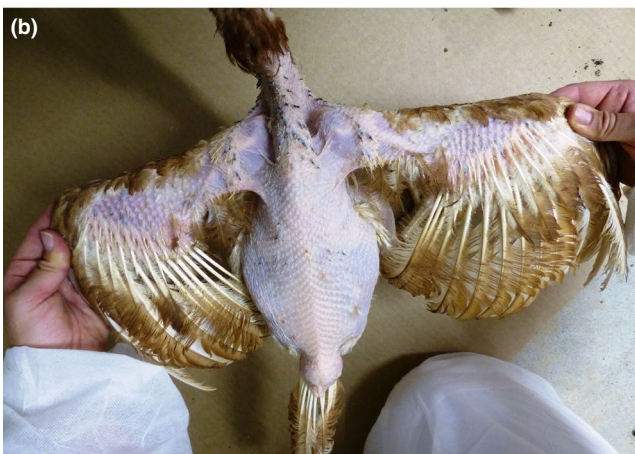
FIGURE 1 The risk of severe feather pecking and plumage damage (a, b) has increased by keeping laying hens with untrimmed beak tips in various European countries (a) (Sepeur et al., 2015)