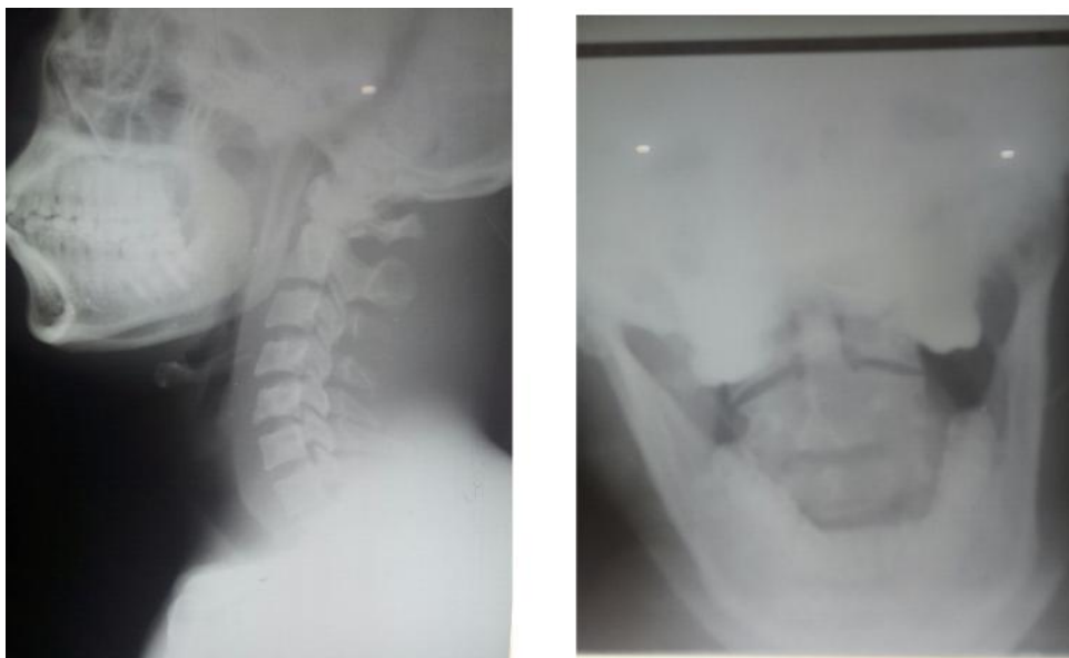
Fig 1: Cervical spine X-ray (Lateral and Open mouth view)

He was managed non-operatively in a rigid cervical collar and immobilized in bed. He progressively