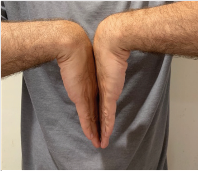
Figure 2. Phalen Test. Dorsum of hands placed together so that maximum wrist flexion is achieved. This is held for 60 seconds.