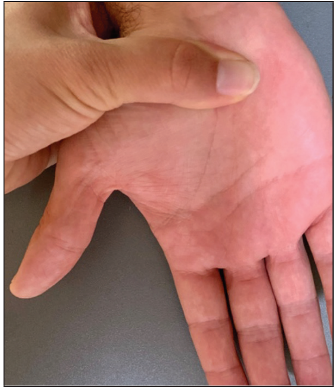
Figure 4. Median Nerve Compression Test. With patient's wrist at neutral, the examiner places moderate pressure over the carpal tunnel for 30 seconds.