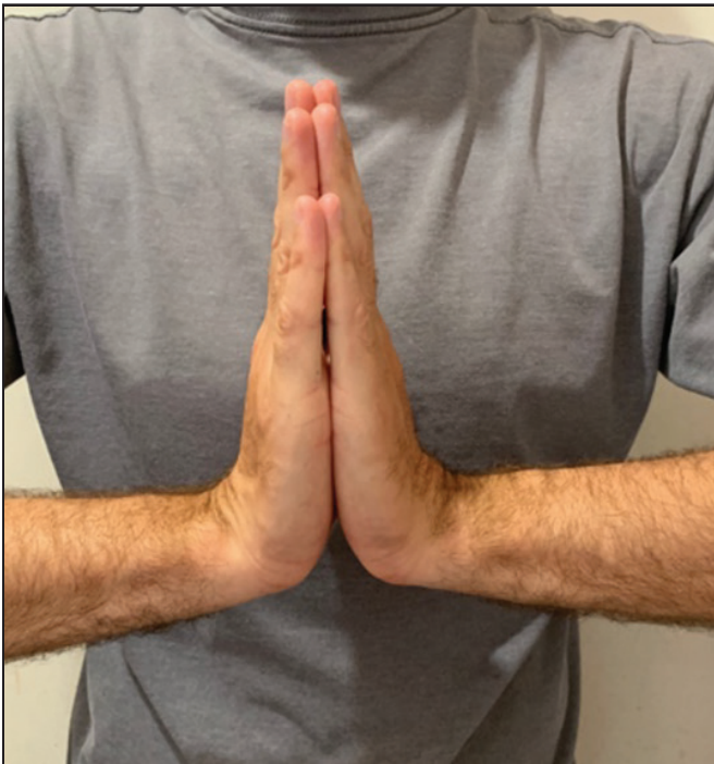
Figure 3. Reverse Phalen Test. Palms of hands placed together so that maximum wrist extension is achieved. This is held for 60 seconds.