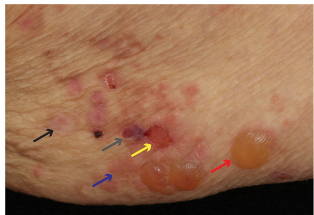
Fig. 1 Typical co-existence of inflammatory skin lesions in different stages of development, including an emerging skin lesions in the shape of an urticarial plaque (blue arrow), a skin blister (red arrow), an erosion (yellow arrow), a resolving/healing erosion (grey arrow), and a resolved/healed skin lesions (black arrow) on the medial aspect of the upper arm of a BP patient during an acute flare

The clinical presentation of BP is variable but in its typical and most common clinical presentation, it exhibits the eruption of inflammatory skin lesions with the individual skin lesion progressing from erythema through urticarial plaques, blisters, and erosions to uninflamed and scarlessly re-epithelizing skin [2, 29] (Fig. 1). Thus, herein, the latter stage represents a state of resolving or resolved skin inflammation