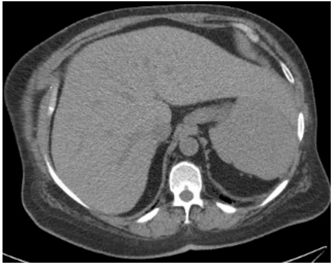
FIGURE 2: Computed tomography (CT) of the abdomen did not reveal any abnormality

Liver ultrasound showed normal liver echotexture. Human immunodeficiency virus (HIV) screening, hepatitis B and C panel, and urine toxicology screen were negative. On careful review of history, she revealed that she has "food allergies" and thus had been eating only pasta and sea salt for the past two years. She had never seen an allergist and had not undergone any testing that would truly establish her suspicion of food allergies. She had not visited a primary care physician for years leading to this visit. On further testing, serum folate level was <2 ng/ml (normal range: >7 ng/ml) and vitamin B12 level was 16.3 ng/ml (range: 200-900 ng/ml). She was transfused four units of packed red blood cells. She was given cyanocobalamin intramuscular injection 1000 mcg daily for one week, then weekly for one month followed by a monthly injection of 1000 mcg. Flow cytometry showed relative neutropenia with left-shifted maturation and 0.1% myeloid blasts. There was no immune phenotypic evidence of a B or T cell lymphoproliferative disorder. The patient's hemoglobin improved to 10.3 gm/dl after four days (Table 1). She was also recommended to follow up with a psychiatrist and nutritionist on discharge from the hospital. Her complete blood count showed a complete resolution of pancytopenia at two months follow up. Her vitamin B12 and folate level also normalized (Table 2).