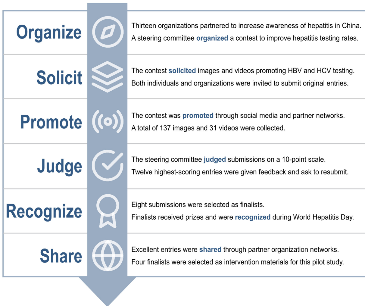
Fig. 1. Development of images and videos to promote HBV and HCV testing through a public challenge contest. Contest implementation is presented in six stages: (1) organizing a steering committee, (2) soliciting entries, (3) promoting the contest, (4) judging entries, (5) recognizing excellent entries, and (6) sharing entries. The six stages of contest development are adapted from Wisdom of the Crowds: Methods for Organizing Crowdsourcing Challenge Contests for Health .

China. There were no restrictions on participants forwarding the images or videos to others.