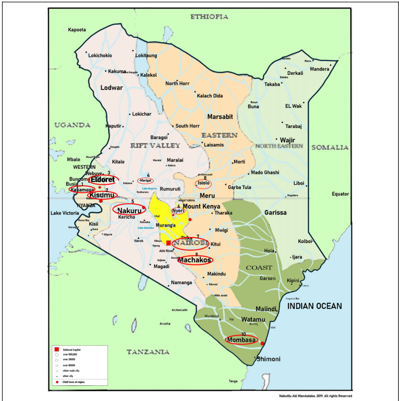
Figure 1. Map of study area ( http://auctiontheglobe.com/ke ). Key: 1 = Kakamega, 2 = Kisumu, 3 = Eldoret, 4 = Marigat, 5 = Nakuru, 6 = Nyeri, 7 = Nairobi, 8 = Isiolo, 9 = Machakos, and 10 = Mombasa.

Data were collected from medical administrators with knowledge about the capacity of their facilities with respect to types of services provided, availability of equipment, and other related resources. We sampled records of 1048 patients with cancer and 12 health-care facilities and conducted at least one patient interview from each facility. Due to health workers strikes, scheduling problems and lack of response from some of the targeted facilities, or their delayed internal approvals,