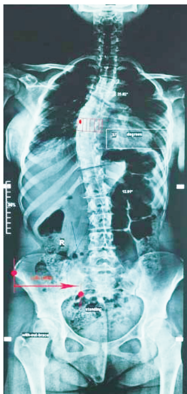
Fig. 1. Illustration of the hemi-pelvic landmarks (inferior ilium at the sacroiliac joint, medially, and anterior-superior iliac spine, laterally) and vertebral rotation measurements.