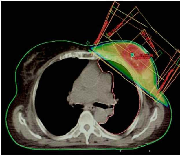
Figure 1. Example of simultaneous integrated boost dose distribution in irradiation of the left breast.

patient after three fractions at the patient’s request, against physicians’ advice.