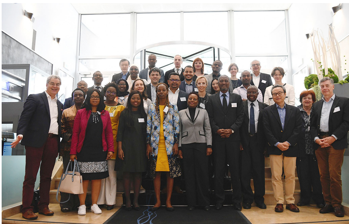
Figure 1 Group photo, Novotel Genève Centre.

'eczemas' in the WHO non-NTD chronic conditions list, which probably includes many cases of contact allergy and other eczematous conditions, remains a problem, compounded by the lack of validated diagnostic criteria for AD adapted to black African skin and environments. In addition to difficulties with diagnosis, barriers to the implementation of therapeutic education include, as for NTDs, poverty, inadequate facilities, shortage of skilled health workers, illiteracy, language and cultural barriers. The possibility of following an 'integrated' approach, as for NTDs, by better education of primary healthcare workers, including using digital technologies, may improve appropriate primary patient care and patient referral to specialists when necessary. 7