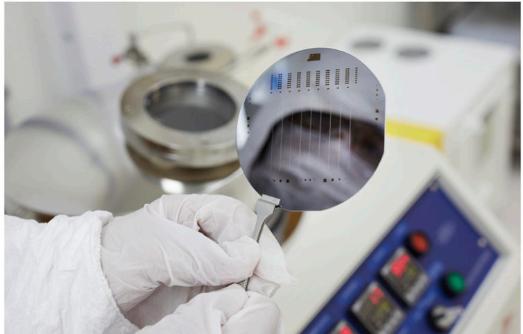
Silicon wafers of thin-film microfabricated electrodes can be implanted into a patient to record from or stimulate the nervous system—the vagus nerve in particular.

Driving growth in bioelectronic medicine is a convergence of advances in neuroscience, electronics, materials science, molecular medicine, and biomedical engineering, alongside more than a billion dollars of investments from government and industry. Within the next decade, researchers say, modulating the body's neural networks could become a mainstream therapy for many of today's greatest health issues—from arthritis (1), asthma (2), and Alzheimer's disease (3) to depression (4), diabetes (5), and digestive disorders (6, 7). Stimulating nerves also shows promise in treating cardiovascular disease (8) and septic shock (9), even in improving cognition (10).