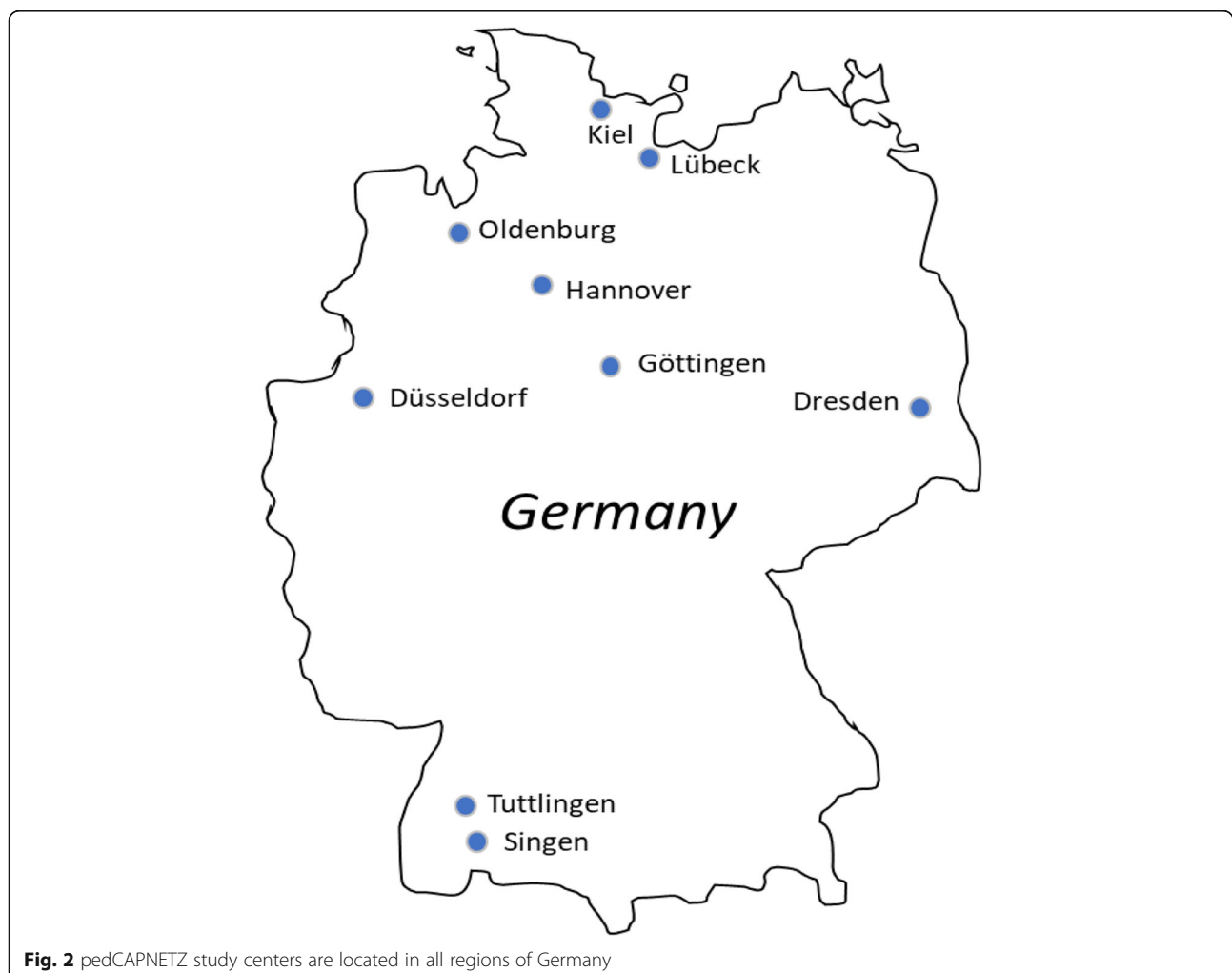
Fig. 2 pedCAPNETZ study centers are located in all regions of Germany

The pedCAPNETZ registry is embedded into the well-established CAPNETZ infrastructure. Within the first year of pedCAPNETZ funding, all necessary protocols and infrastructure including an online data input platform and a large central pedCAP biobank were developed. The setup includes an online platform for electronic case report form (eCRF) based data input for the collection of thorough epidemiological and clinical data. The central pedCAP biobank enables extensive biosampling for diagnostic purposes and multi-omics analyses. The biobank is located at the Hannover Unified Biobank, (Hannover Medical School, Hannover, Germany). The reference laboratory for pathogen sequencing is located at the Institute for virology at the University of Freiburg, Germany.