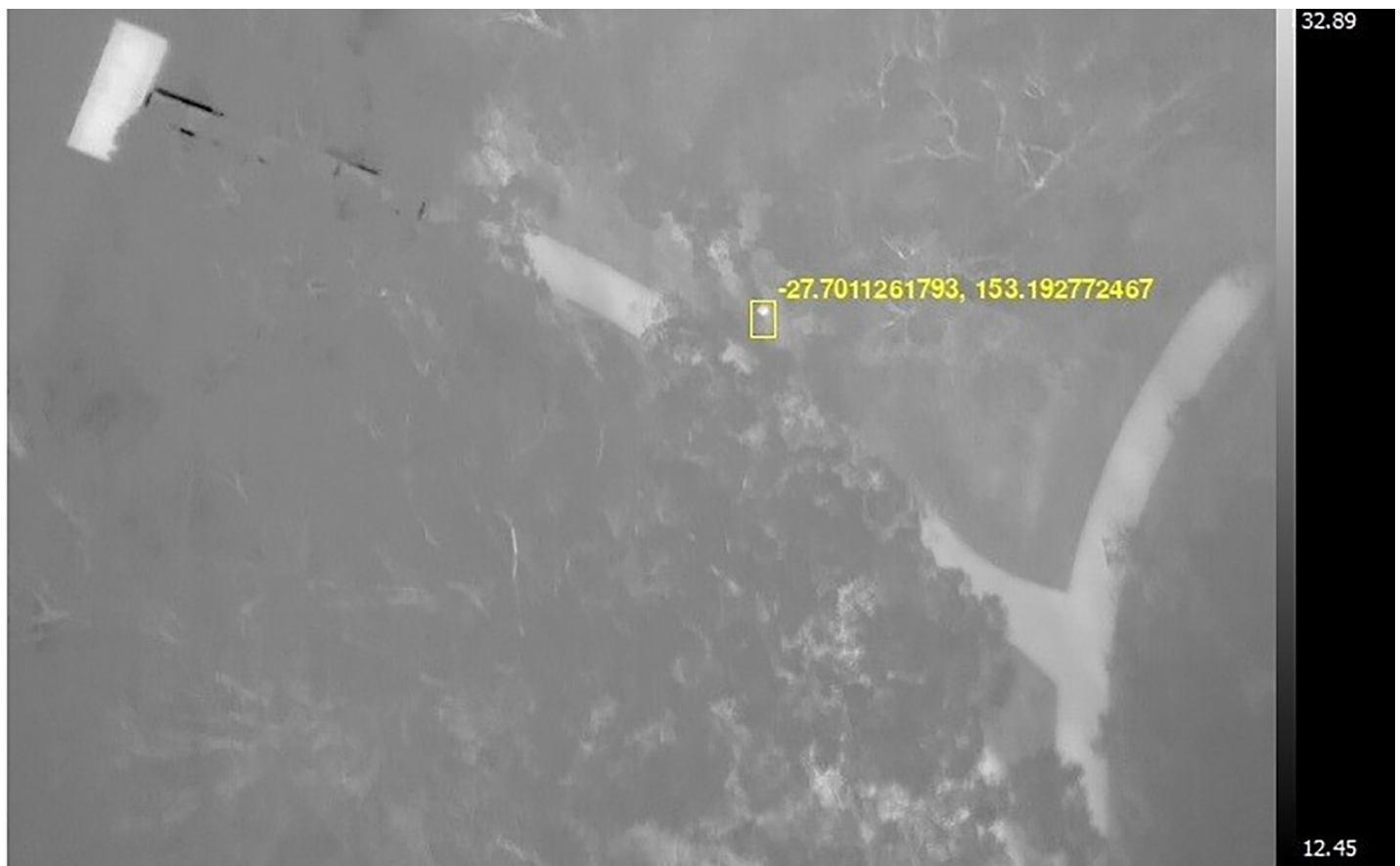
Fig 1. Airborne thermal image. Example of a thermal image of a koala captured by the Remotely-Piloted Aircraft Systems during thermal-imagery surveying of the study area.

The complete dataset of 82 koala observations contained 41 presences and 41 absences, each recorded at a unique location in the study area (S1 Table). Fifteen of the presences were identified from sightings made during opportunistic ground surveys conducted by citizen scientists between 2012 and 2017 [24]. Two more sightings were made by the project team in December 2017 while thermal imagery was captured (see below). The remaining 24 presences were identified from aerial thermal-imagery surveys conducted in October 2016 [23] and December 2017. On both occasions, thermal imagery was collected during RPAS (DJI M600) flights conducted over the study area for later identification of thermal hotspots as 'potential' koalas (Fig 1). A Tau-2 640 captured forward-looking infrared radiometer footage while a Mobius Action Camera and Sony NEX5 captured red-green-blue footage. The RPAS was flown at 60–70 m above ground to accommodate the size of the site within time constraints in the morning (between 5:50 am and 9:20 am; 2016 and 2017) and evening (between 3:53 pm and 5:56 pm; 2016 only), following line transects 8.37 m apart and orientated west-northwest to east-