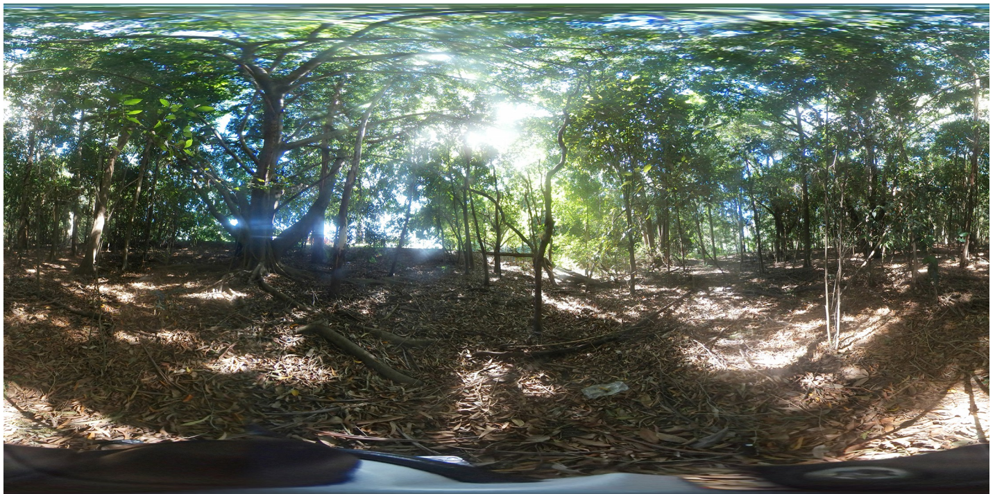
Fig 2. A 360-degree image. Used for virtual reality expert elicitation, showing a site where a koala had been observed during a ground survey. Image by Grace Heron, December 2017.

Subsets of images that captured the range of koala habitat at the 82 koala observation sites were shown to six koala experts. To generate the subsets, we used cluster analysis (complete-linkage unweighted pair grouping method with arithmetic mean and the Gower distance measure; [40]) to group sites based on vegetation height and density, distance to water, FPC, and koala presence or absence. The resultant clusters contained between 7 and 11 sites each. Images of sites were then captured in December 2017 using a Samsung Gear camera (Fig 2). Finally, we converted these images into 360-degree views using the game engine Unity (Unity Technologies, San Francisco, www.unity3d.com ).