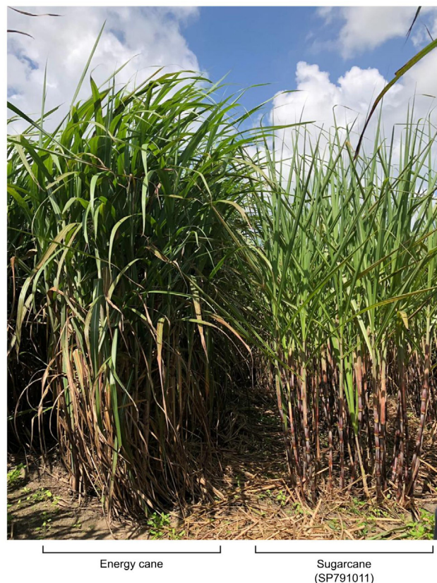
Fig. 1. An energy cane RB hybrid and a sugarcane variety (SP791011) at six months after planting, under field conditions at the experimental site 'Estação de Floração e Cruzamento da Serra do Ouro' (lat 9° 13' S, long 35° 50' W, alt 450 m asl) in Alagoas, Brazil.

Compared to sugarcane commercial varieties, energy canes have higher ratooning ability and number of tillers [27,29,30,33], which combined are very important in defining total biomass yield (Fig. 1). Because this crop is "vegetative propagation based", this characteristic is also important in overcoming one of the most significant economic constraints in the cane cultivation: clonal multiplication [27]. In addition, there is also a profound difference regarding the root systems; energy cane produced an abundant and vigorous root system, surpassing the conventional cane in