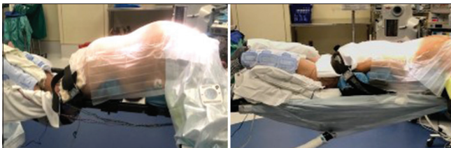
Figure 1: Image showing proper Bair Hugger placement. Left image shows upper body Bair Hugger (Group I), right image shows lower body Bair Hugger (Group II).

Following IRB approval, a prospective, randomized control trial was undertaken at a single institution. Consecutive patients 18–75 years of age undergoing elective lumbar spine surgery between December 2017 and May 2018 were enrolled in this study. Exclusion criteria included: (1) history of arterial or venous thromboembolic disease, (2) known heritable hypercoagulable state, (3) active infection at the surgical site, (4) intravascular clotting disorder, (5) active malignancy, and (6) receipt of intraoperative blood products. Patient was randomized to either having an upper body Bair Hugger placed on top of upper back and arms (Group I) or to having a lower body Bair Hugger secured under the torso and legs (Group II) using an online random integer generator (Random.org). Our primary outcomes were average intraoperative body temperature, incidence of hypothermia, postoperative medical complications, and