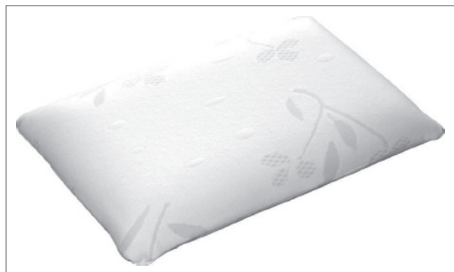
FIGURE 1: Visco-elastic polyurethane Memory Foam® pillow (62 cm × 40 cm × 12 cm).

In addition, the present study utilised the NDI, which is a valid and reliable (Ackelman & Lindgren 2002) revised version of the Oswestry Index, which measures the impact and effect of neck pain on the day-to-day life of patients (Vernon 1996). Using this questionnaire, each participant was required to complete the questionnaire by indicating which statement best suited and described their condition using a rating of 0–5, with 0 indicating the least impact and 5 the highest. The NDI has 10 sections to be completed with a possible maximum score of 50 points. An advantage of using the NDI scoring system is that the MCID can also be determined. Specifically, Young et al. (2009) indicated that an MCID in the NDI of 7.5 points equates to a 15% improvement in neck pain and the patient’s day-to-day life.