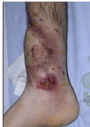
Fig. 2. a–e: (a) Implant related chronic osteomyelitis of the tibia with sinuses. (b) Tibial shaft non-union in the same patient treated with plate/screws for open fracture; (c) During surgery, infected skin, soft tissues and infected/dead bone were excised; (d) The medullary canal was opened both sides and the remaining cavity was adequately prepared and filled with CERAMENT G; (e) Instability was present (CM stage IV osteomyelitis) and an Ilizarov frame was added to the construct.2f–g: At 8 months post-surgery the tibial non-union has gone on to complete healing and the biocomposite has been replaced by bone and started remodelling.

infected/devitalised skin, sinus tracts and soft tissues and bone was excised. When necessary, a plastic surgeon performed or advised on extension of the skin incision in order not to jeopardise performance of successive flaps or skin viability. Infected metalwork was removed until healthy and bleeding bone. Multiple deep tissue samples were collected, sent for microbiology and intravenous antibiotics were started according advice from an infectious disease specialist. The remaining cavity, after excision of infected bone, was washed then irrigated with dilute (50/50) hydrogen peroxide solution and dried by gauze packing. The dry cavity was now filled with CERAMENT G. If instability was present (i.e. CM stage IV osteomyelitis) external fixation (usually an Ilizarov frame) was added to the construct Fig. 2a–e. Provision was always taken to facilitate access to the area when a free/local flap, split thickness skin graft (STSG) or primary closure was required from the plastic surgery team. Post operatively, antibiotic treatment continued for a period up to 12 weeks. After removal of the circular frame a fracture boot was used for a period of 4 weeks and full weight bearing was allowed.