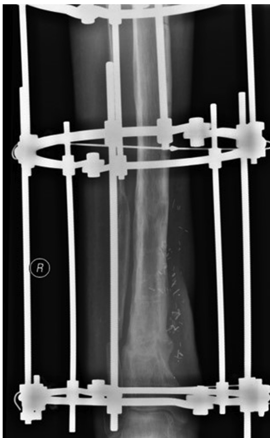
Fig. 2. (continued)