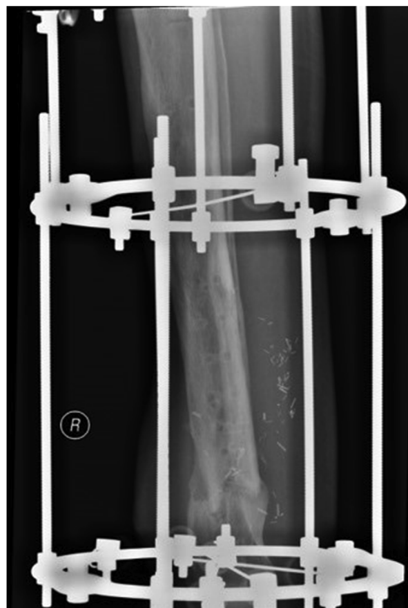
Fig. 2. (continued)