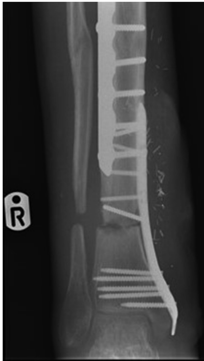
Fig. 2. (continued)