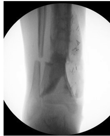
Fig. 2. (continued)

The tibia was the most commonly involved bone (47 patients/90%) followed by the femur (2 patients/4%), the foot (2 patients/4%) and in 1 (2%) patient there was an infected total ankle replacement (TAR).