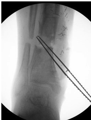
Fig. 2. (continued)

Consent was taken from all patients included in the study. The study was approved by the local Ethical Committee as part of the Clinical Effectiveness and Audit Department and was performed in accordance with the ethical standards of the 1964 Declaration of Helsinki as revised in 2000.