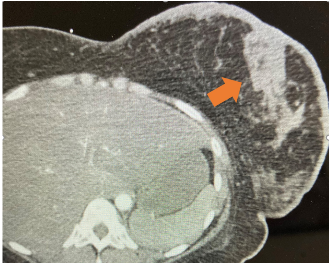
FIGURE 2: Computed tomography of the chest

An abnormal soft tissue density within the left breast was noted (orange arrow), along with additional abnormal skin thickening of the left breast.