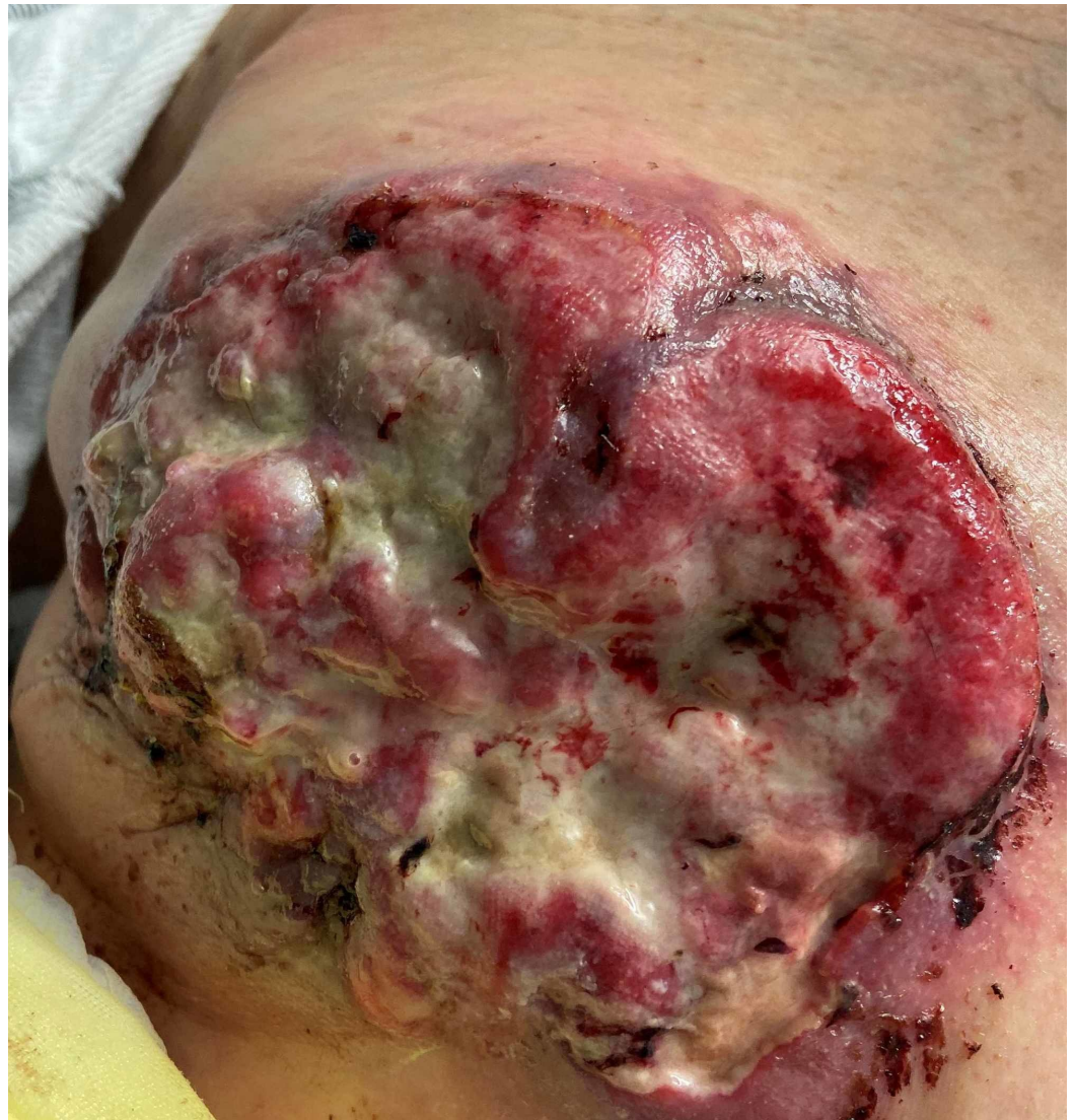
FIGURE 1: Imaging of a fungating left breast lesion with irregular margins and overlying necrotic and purulent

On exam, she was lethargic, tired, tachycardic to the 140s, tachypneic, febrile at 101° F, and hypoxic to 87% on room air, requiring oxygen via nasal cannula. The cardiovascular, pulmonary, and neurological examinations were grossly normal. The entire left breast was firm and had extensive skin thickening with a reddish discoloration. Overlying erythema, necrotic tissue, and foul-smelling purulent discharge were present (Figure 1). There was significant left axillary lymphadenopathy.