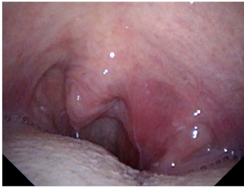
Fig. 1. Left peritonsillar abscess.