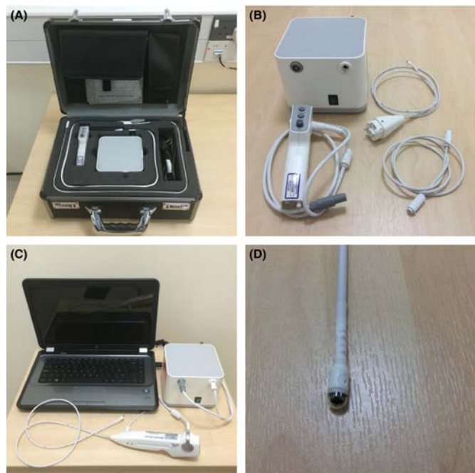
Figure 1 The EG Scan II system. (A) The portable case with four main parts; (B) the image processor (top left), disposable probe (top right), air tube (bottom right) and hand-held controller (bottom left); (C) the system connected and ready for use; (D) close view of the capsule probe tip. (Reproduced with permission from Sami, et al ; Copyright, John Wiley and sons).

Specific consent forms for these interviews were devised and confirmation of consent was obtained prior to each