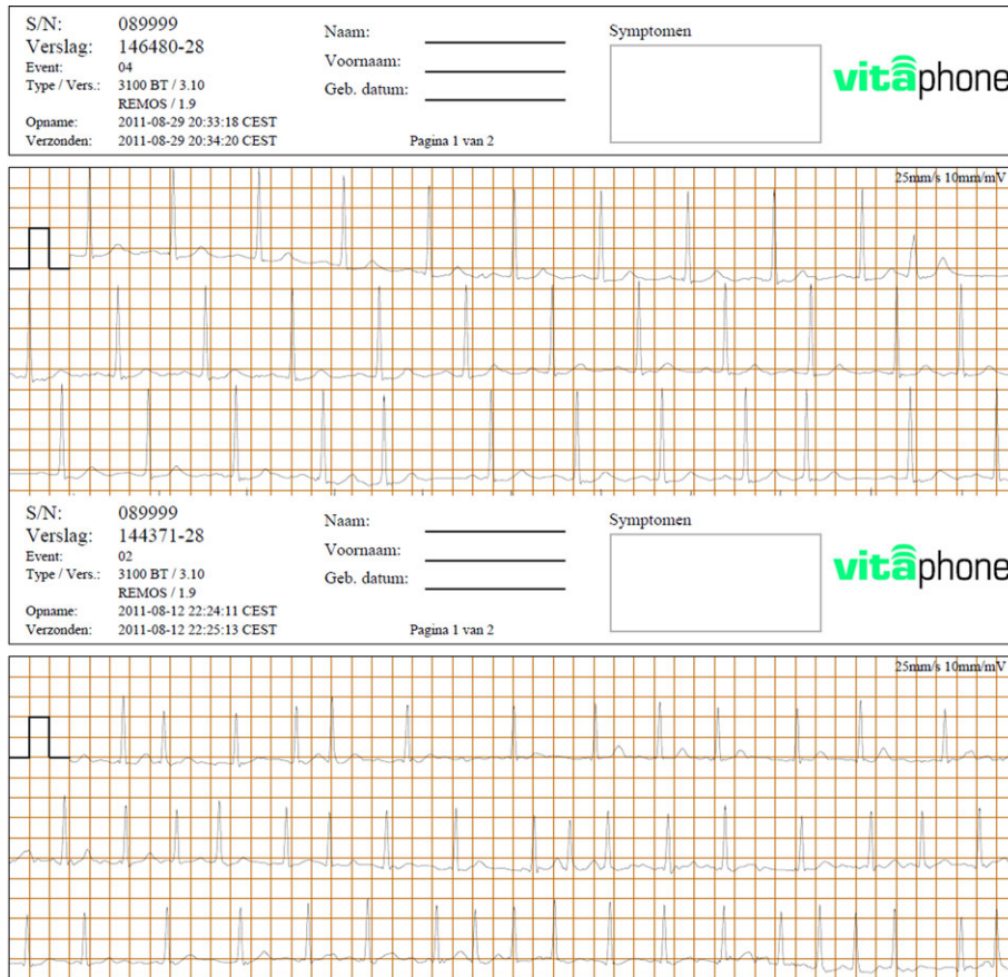
Figure 2. Top electrogram shows a false positive AF registration (event 04) based on premature atrial complexes; bottom electrogram shows a false negative AF registration for AF designated as a tachycardia.

MIT-BIH AF and MIT-BIH NSR data set containing several episodes of AF and other arrhythmias. Incorporating a high signal quality by means of an implantable loop recorder equipped with a sophisticated algorithm is still no guarantee for success as reported by Eitel et al. 13 This suggests that real-life validation of a specific device is desirable.