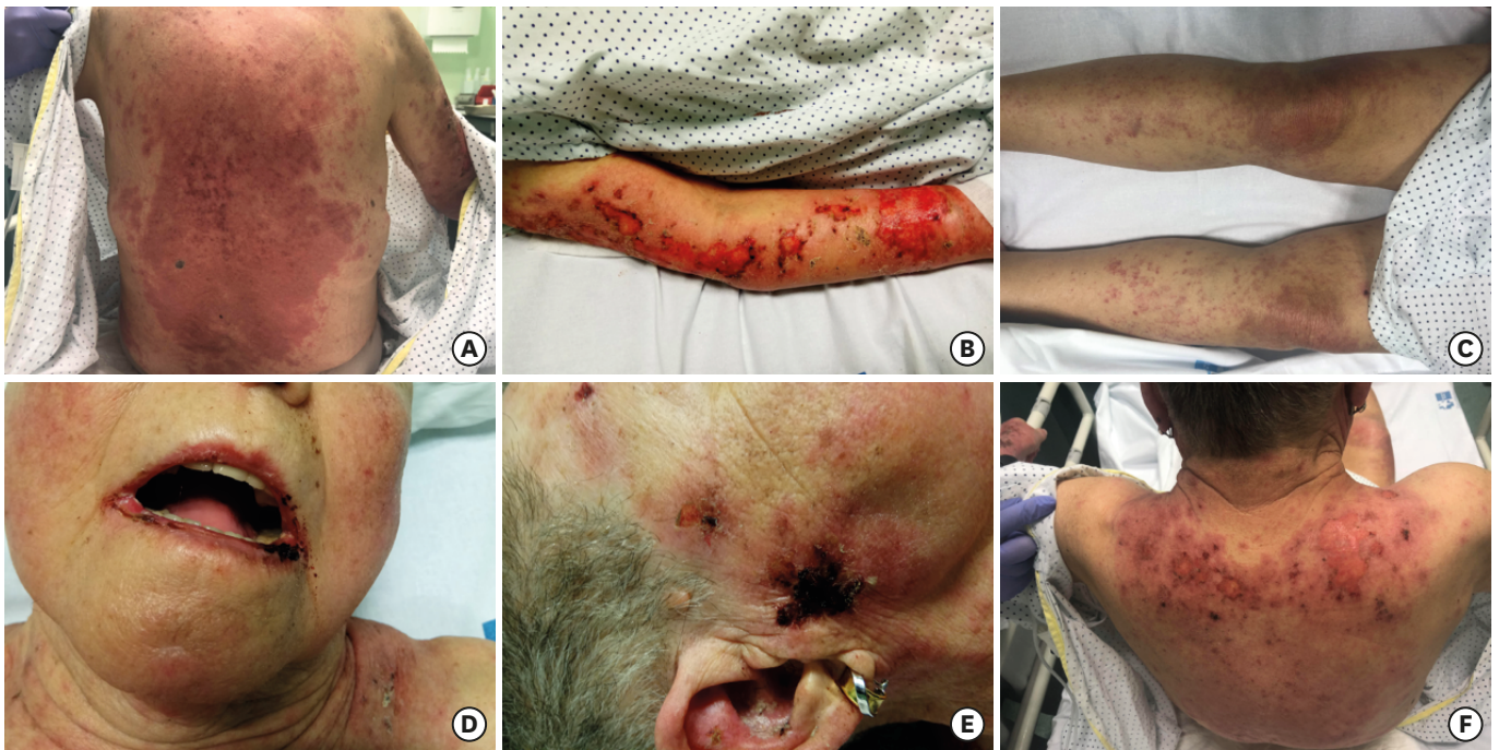
Figure 1. Image shows coalescing erythematous maculae along whole dorsal (A) aspect and chest as well as symmetric and bilaterally evolving lesions on both upper and lower limbs (B, C). Active exudative bleeding was identified within the extensor surface of both upper limbs (B, C), lips (D), preauricular area, ear scaphae (E), and shoulders (F).

Given the suspicion of ribociclib-mediated SJS, the patient was started on aggressive intravenous fluid therapy. A single dose of 40 mg subcutaneous etanercept was administered, and the patient was started on daily cyclosporine at 4 mg/kg. She was admitted to the inpatient burn unit for further support.