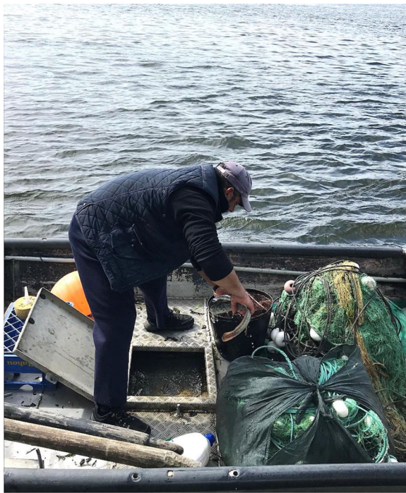
Fig. 3 Typical sea lamprey fisher after a fishing trip operated by a small inland boat (< 6 m), through drifting trammel nets ( lampreeira ) in the fishing village of Lanhelas, Portugal. (Images published with the prior consent of participants)

power to go to sea. I use “crazy” lampreys as bait for sea fishing.”