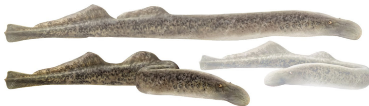
Fig. 2 Image of the ethnozoological object of study (sea lamprey) carried out in the riverside villages of the Minho river. Credits: F. Correia (aut.: C. Barrocas)—Scientific Illustration Laboratory of the University of Aveiro, Portugal

Interviews were conducted with fishers at Caminha ( N = 13 ), Seixas ( N = 6 ), Lanhelas ( N = 14 ), and Vila Nova de Cerveira ( N = 7 ) to report the local knowledge on sea lamprey in the Minho river (Table 1). Only one interviewed was a fisherwoman. The age of the interviewees ranged from 32 to 88 years, with an average of 57.13 ( \pm