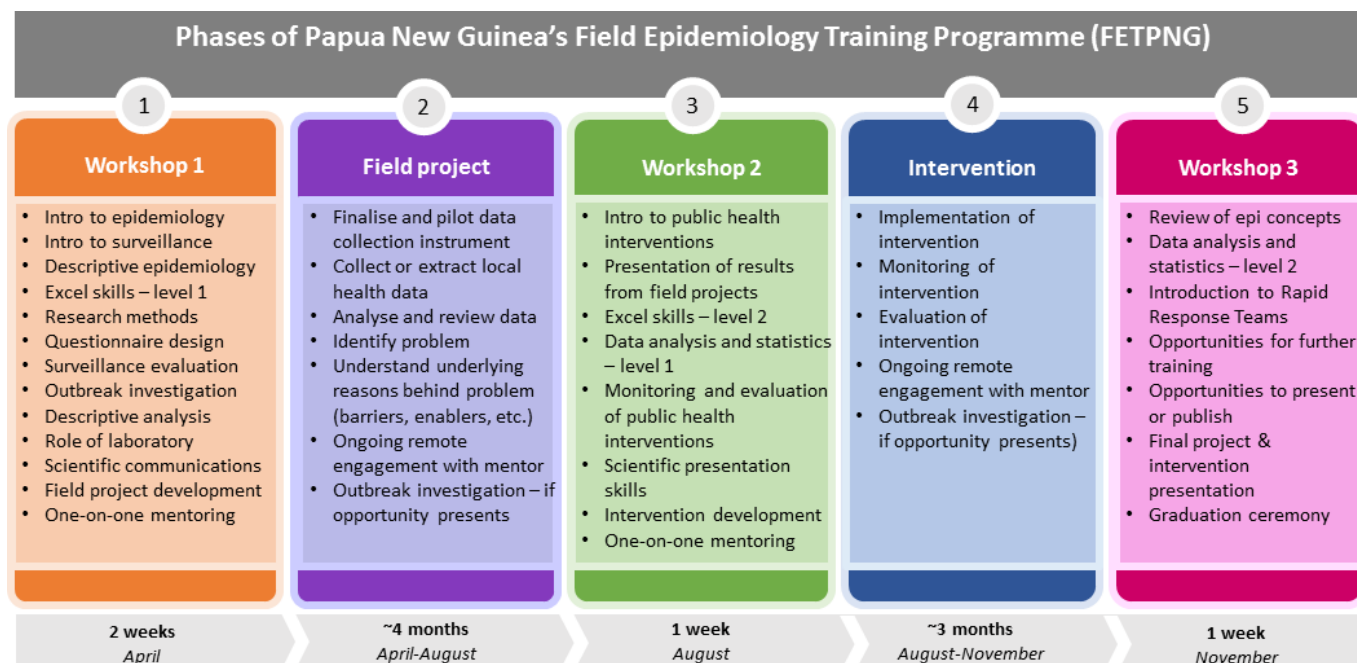
Figure 1 Phases of the FETPNG.

The FETPNG is administered and governed by the NDOH, with overall strategic direction provided by the Senior Executive Management, particularly through the Executive Manager for Public Health. The programme is funded by the WHO PNG Country Office and the NDOH.