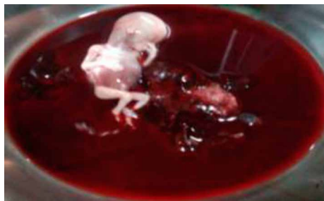
FIGURE 1: Dead male fetus and placenta removed from the peritoneal cavity.