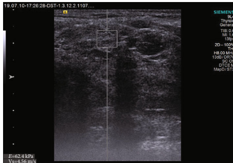
FIGURE 2: ARFI imaging-VTQ of the parotid gland.

Serum beta-2-microglobulin, a marker of B-cell hyperactivity, presented higher values in pSS than in controls ( 2.84 \pm 0.55 mg/l vs. 1.86 \pm 0.44 mg/l, p < 0.0001 ). Higher values of serum beta-2-microglobulin were correlated with SGUS score ( r = 0.9396 , p < 0.0001 ).