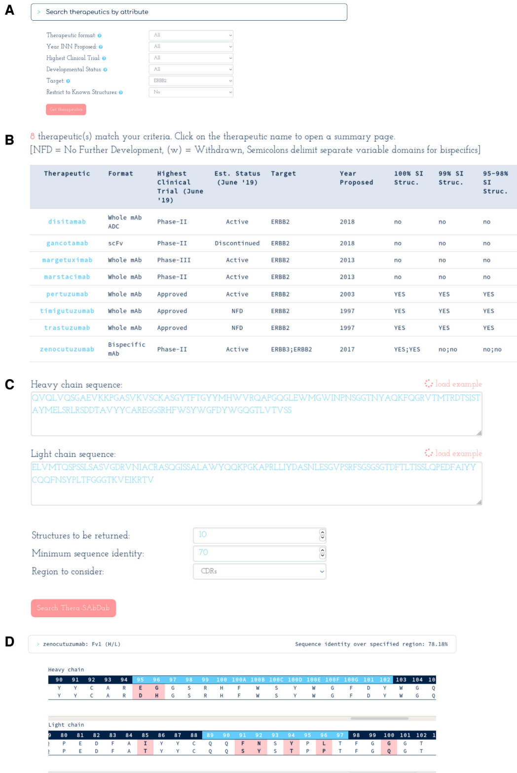
Figure 2. Searching Thera-SAbDab. (A) Search by attribute. Here, we search for any therapeutic designed to bind to ERBB2 (often over-expressed in breast cancer). (B) Eight therapeutics are designed to bind to ERBB2, seven monoclonals and one bispecific. Four have exact structural information for the ERBB2 binding site. Click the therapeutic name to enter the therapeutic summary page. (C) Search by sequence. Here we search for therapeutics with at least 70% sequence identity across the heavy and light chain CDRs of the input sequence. (D) Any results are returned alongside sequence identity across the specified region. Alignments show any sequence mismatches across the variable domain sequence.