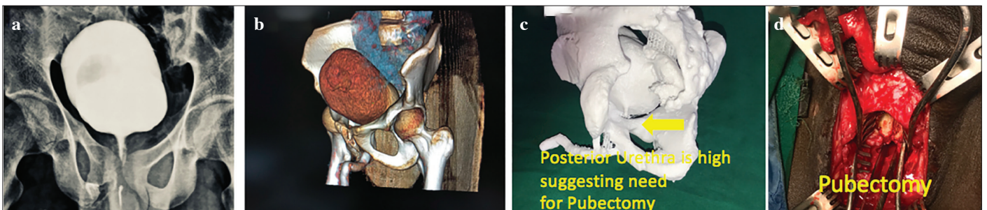
Figure 1. a-d. MCU of a patient with PFUI. (a) 3D reconstruction on CT scan. (b) 3D printed model. (c) The posterior urethra is above the inferior margin of the pubic bone as depicted by the printed model, suggesting the need for inferior pubectomy (d)

These models help us understand the anatomy of the posterior urethra. These depicted the exact displacement of the posterior urethra, its relation to the pubic bone, its relation to the rectum, displacement from the midline, and also the status of the anterior urethra. In a female patient after PFUI, she had continence with incontinence of urine. On 3D CT (Figure 3c) scan and then 3D printing, it was found that she was voiding in the vagina due to hypospadiac meatus. We operated based on this and made a distal pedicled labial flap tube, and the patient is continent.