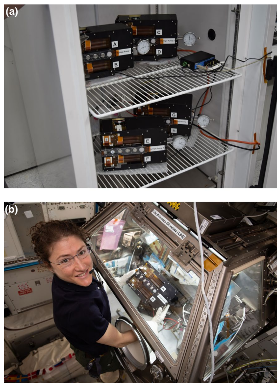
Figure 2 RE-engineered self-contained modules. (a) Each module contains two housings each with 3 triplex chips, two media cassettes, piston-driven pumps and environmental control (temperature, humidity, CO 2 ). All four modules pictured here were deployed to the International Space Station United States National Laboratory. Four identical modules, not shown, were utilized for the time-synchronous ground control experiment. (b) On-station manipulation was performed by Astronauts Anne McClain and Christina Koch (pictured).

aggregate based on size and density instead of distributing in an anatomically correct manner. In contrast, cells in microgravity tend to self-assemble slowly and aggregate based on cell-to-cell contact and intrinsic physiologic affinity. 10