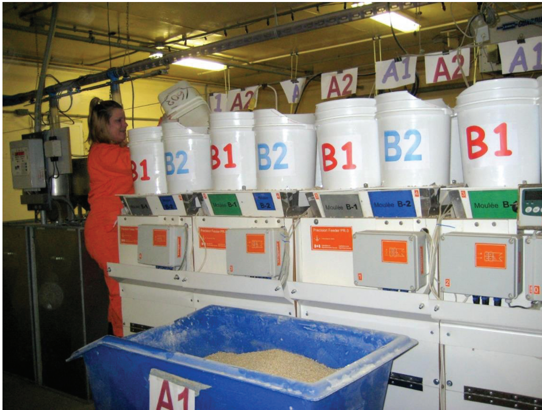
Figure 3. Calibrating the precision feeding mathematical model (Cloutier et al., 2015) using four feeds in each feeder. Feeds A1 (130% of lysine requirements) and A2 (70% of lysine requirements) are formulated to meet the pig's highest lysine requirements, and B1 (130% of lysine requirements) and B2 (70% of lysine requirements) are formulated to meet the pig's lowest lysine requirements.

that daily adjustment of the diet resulted in a 27% reduction in total lysine supply, without detrimental effects on growth. This additional 20% reduction in lysine intake in relation to group-fed pigs could be obtained by feeding the animals individually and thus controlling simultaneously the time-dependent and the between-animal variation. Although feed cost reduction depends to a great extent on feed prices, it is expected that feed cost can be reduced by 1% to 3% when only controlling the time-dependent variation while an 8% to 10% reduction can be obtained when controlling both sources of variation. Nitrogen excretion was reduced by nearly 30% when pigs were fed with daily tailored diets.