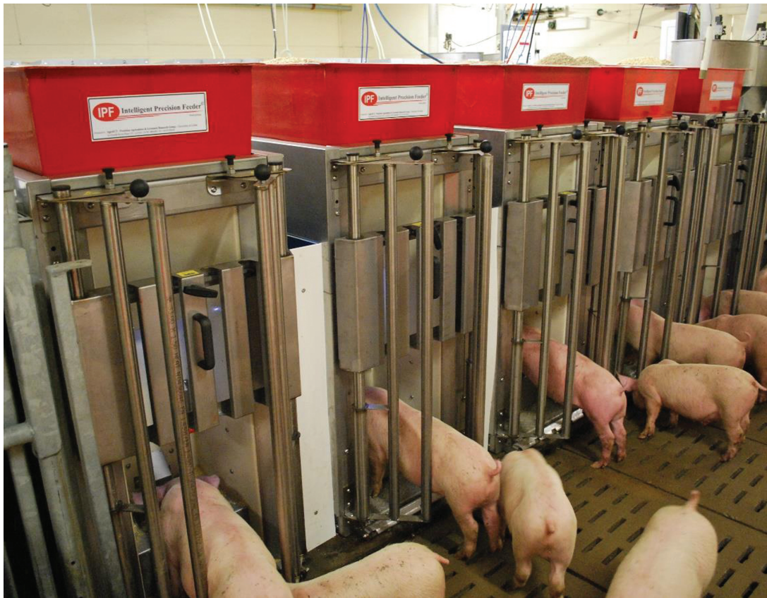
Figure 4. Individual feeders allow one pig at a time to request feed. Each animal is identified by the ear plastic button tags containing passive transponders, which provide pigs with diets that are tailored daily to individual requirements of each pig.

The mathematical model developed to estimate daily lysine requirements in individual growing-finishing pigs (Hauschild et al., 2012; Zhang et al., 2012; Cloutier et al., 2015) is being updated to account for the variation in amino acid efficiency and the requirements of amino acids other than lysine (Remus et al., 2017; Ghimire et al., 2016). Further developments will also include new knowledge concerning the genetic capability of pigs to efficiently use nutrients and integrate in the daily estimation of individual pigs' optimal nutrient requirements, the interaction between feeding patterns, diet composition, and the digestive and metabolic dynamic availability of dietary nutrients. These model improvements will further reduce the environmental footprint of the swine industry with estimated reductions of feed cost of more than 12%, nitrogen and phosphorus excretion of more than 60%, and greenhouse gas emissions of over 12%.