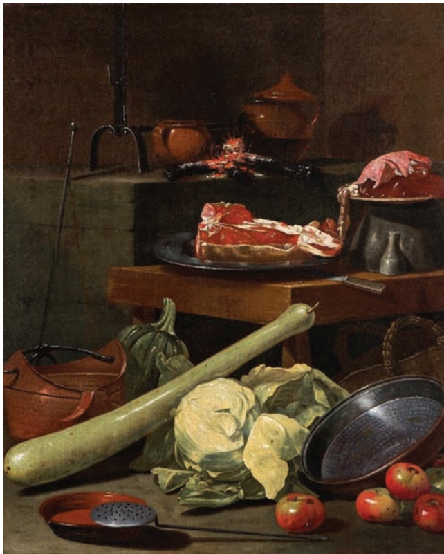
Figure 3. Cristoforo Munari (Reggio Emilia 1667–1720), Still life painting with Fiorentina steak. Oil on canvas, 147 × 117 cm (private collection).

though still few for now, which provide for the protection of nonhuman animals: Switzerland (as of 1973), India (1976), Brazil (1988), Slovenia (1991), Germany (2002), Luxembourg (2007), Austria (2013), and Egypt (2014). An extensive review on animal protection through constitutional charters at the global level can be found in World Animal Net (2014) : “some nations reference the treatment of animals, specifically. Others reference such terms as fauna, species, living things, and nature. The level of protection and recognition afforded to animals through constitutions varies widely by country. Some constitutions, for example, have many provisions where others may