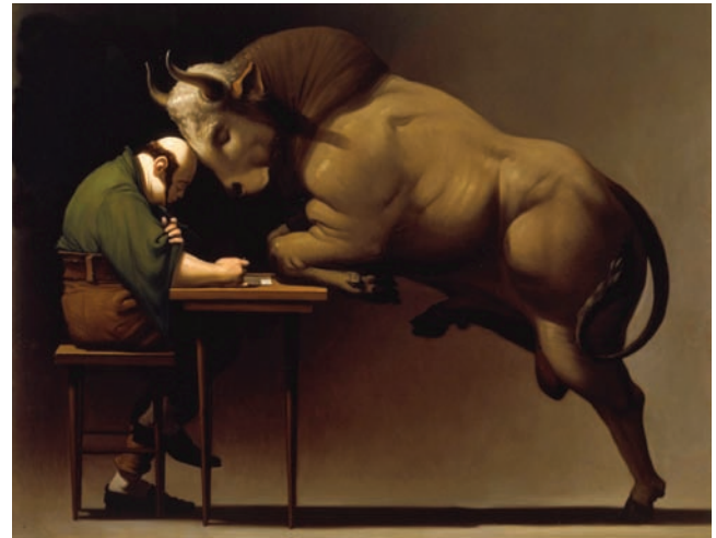
Figure 1. Wainer Vaccari (Modena 1949), Melancholia , 1992. Oil on canvas, 200 × 250 cm (private collection).

On the other hand, taking on ethical issues aimed at the beginnings of life, birth and death, is very difficult when it comes to human affairs, and becomes even more complex when