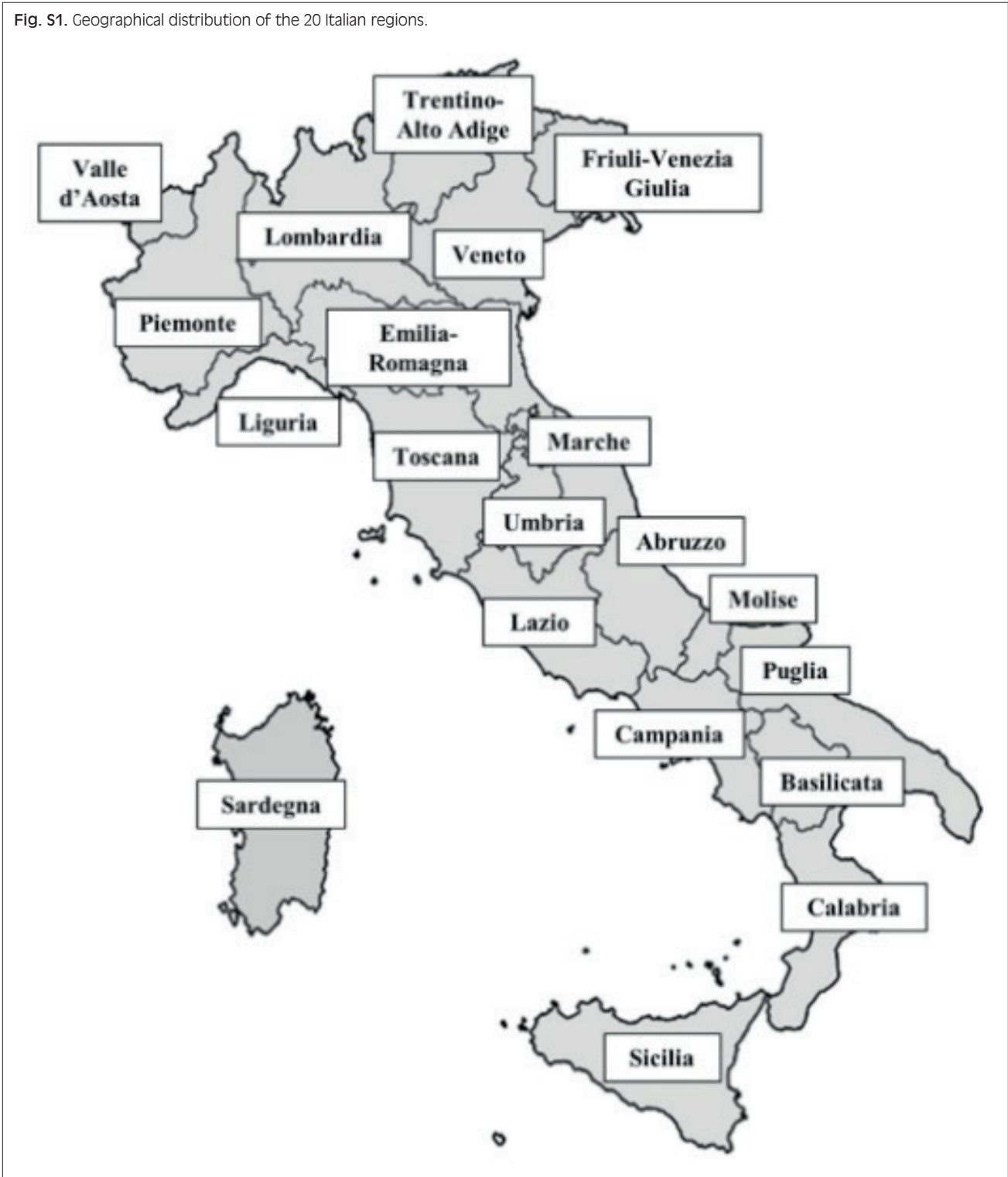
Fig. S1. Geographical distribution of the 20 Italian regions.